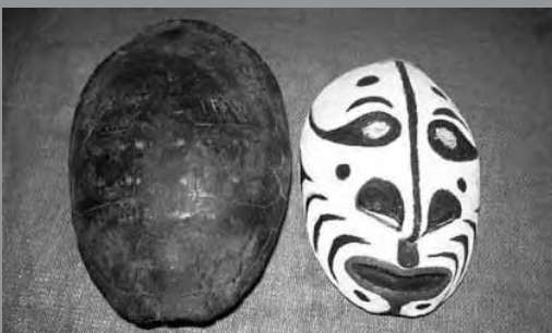
HAWKSBILL CARAPACE AND MASK