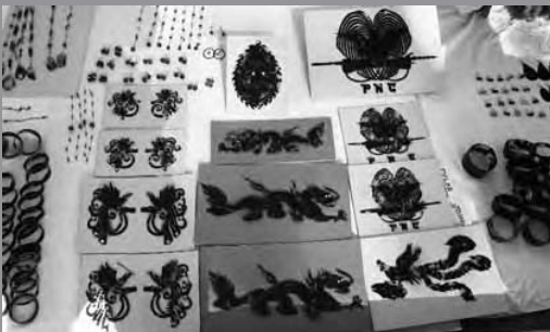
SELECTION OF HAWKSBILL TORTOISESHELL MOTIFS