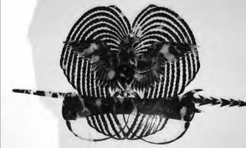
HAWKSBILL TORTOISESHELL BIRD-OF-PARADISE MOTIF