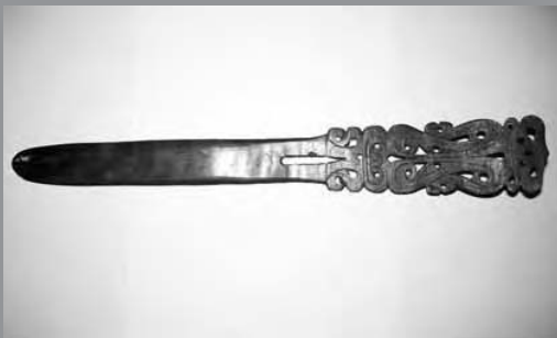
HAWKSBILL TORTOISESHELL CARVING