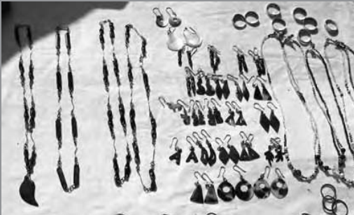
HAWKSBILL TORTOISESHELL JEWELLERY