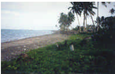
A village-based seawall project in Savai’i.

The Government of Samoa has also stressed the need to improve the processes involved with the construction of buildings to ensure maximum human safety during tropical cyclones and other severe impacts of CC.