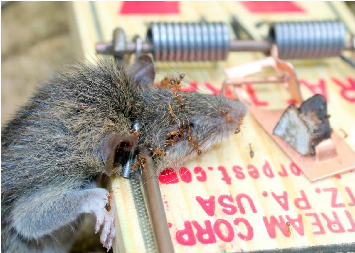
Photo 2. Polynesian rat caught in snap trap in Vini flats with YCA exploring the muzzle.