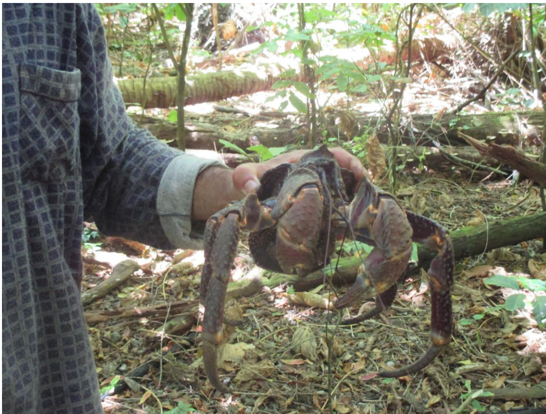
Photo 3. Coconut crab found on Vini flats during day-time.