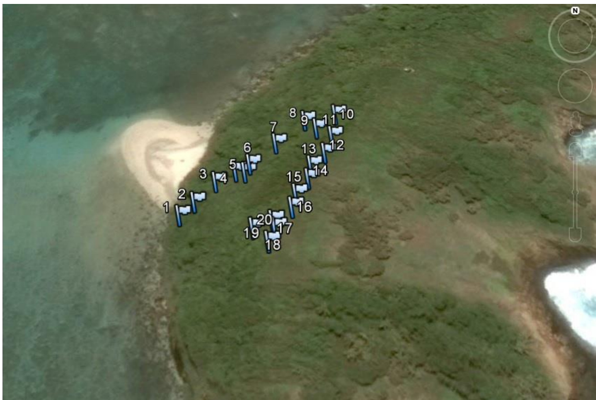
Map 4b. Locations of twenty rat sticky traps laid down across Fenuatapu on 28 October 2015.