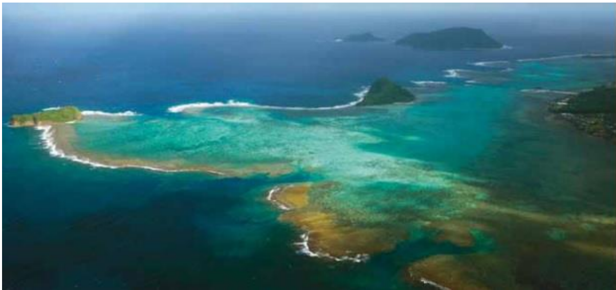
Photo 1. Aerial image of the four islands of the Aleipata group: foreground on the left, Fanuatapu islet; next to the right, Namua island (almost at the center of the image). In the background, Nu'ulua (small to the left) and Nu'utele (larger to the right).

The four Aleipata islands (Photo 1), holding a high percentage of representative and threatened species of Samoa, certainly represent a key site in the Polynesia-Micronesia biodiversity hotspot. In a 1986 review of 226 islands in the South Pacific region, these islands together rated 30 th in importance for biological diversity (Vanderwoude et al. 2006). They were also more recently included in the list of the 7 Key Biodiversity Areas of Samoa (Conservation International et al. 2010).