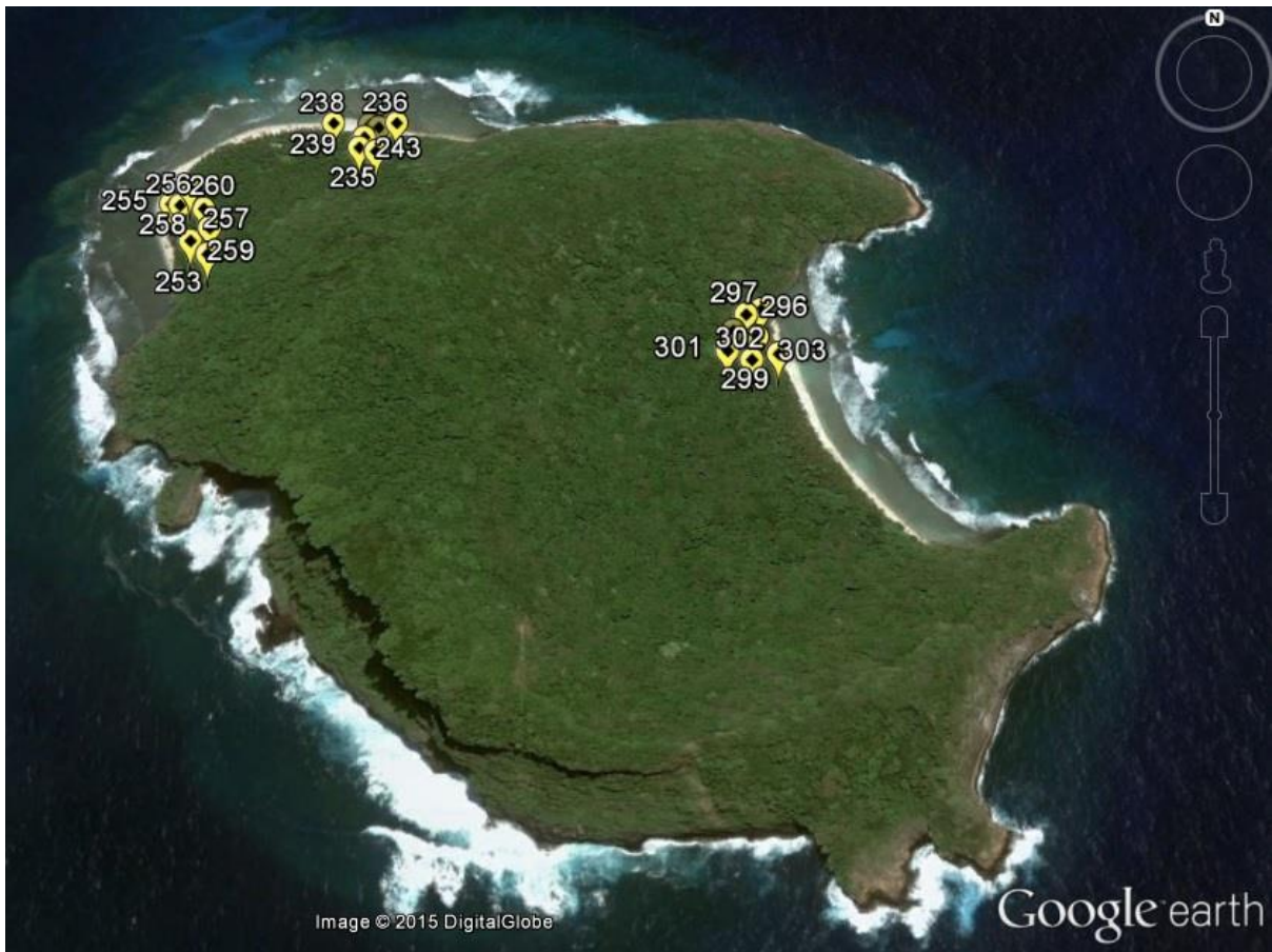
Map 6a. Locations of YCA detections within Nu'utele island in September 2015.