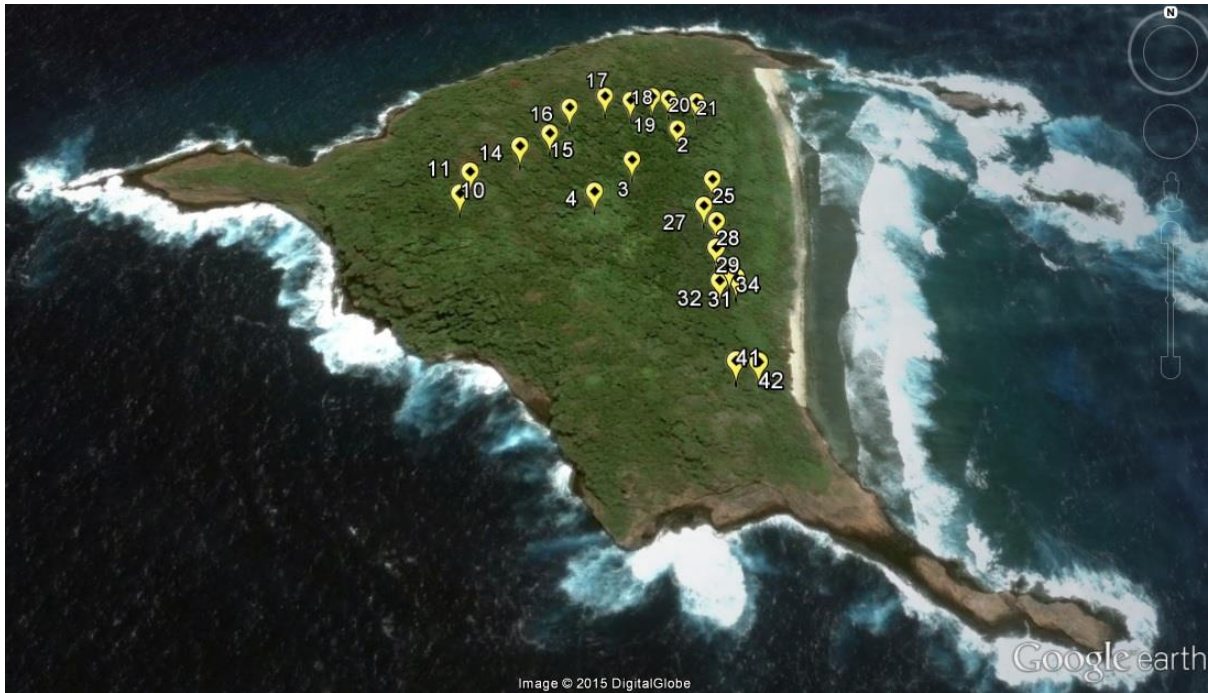
Map 8. Locations of detections of YCA along the transect used for the rat trap stations across Nu'ulua, as assessed on 27 October 2015 (Map: Google Earth).