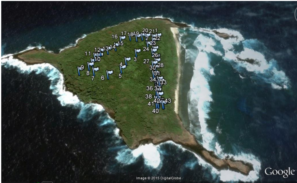
Map 2. Locations of forty-three sticky rat traps laid down across Nu'ulua on 26 October 2015 and associated sites of YCA assessment (Image: Google Earth).