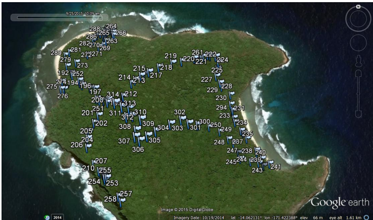
Map 1b. Zooming of Fig. 1a.

A spotlight night search was run on the first night soon after the arrival in Nu'utele aimed at detecting as many rats as possible, comprehensively covering- the so called Vini flats and partially the adjacent slope.