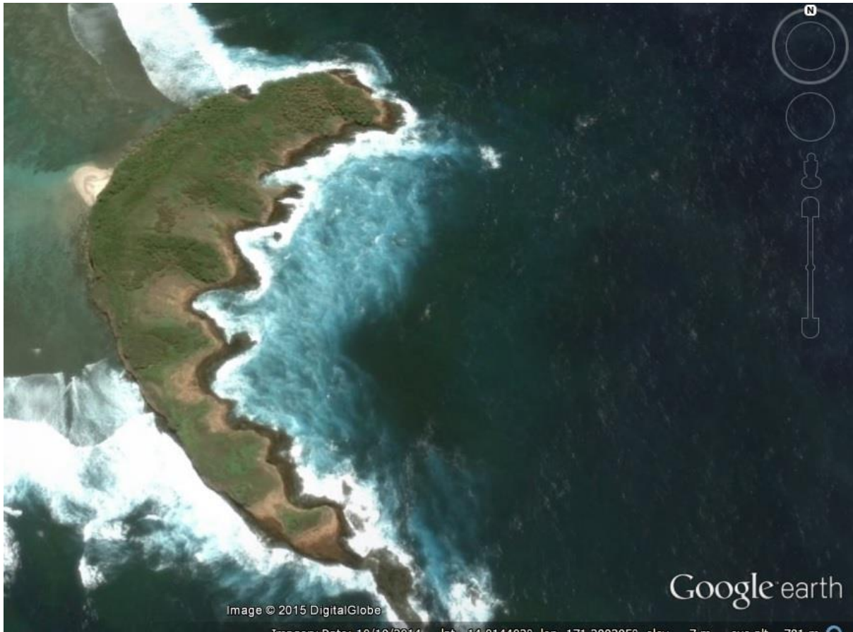
Map 4a. Islet of Fenuatapu.