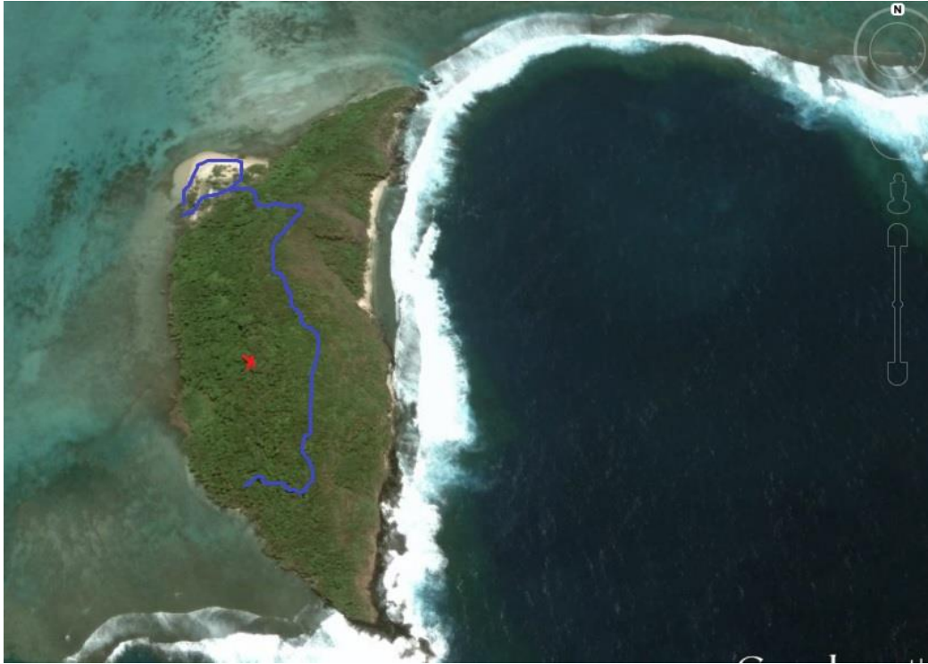
Map 3. In blue, the track followed on 29 October 2015 across Namua island. Red cross: location of roost of fruit bats Pteropus tonganus.