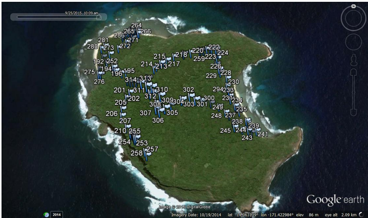
Map 1a. Distribution of 100 rat trap stations across Nu'utele island as they were established during days 22 and 23 September 2015. Each station was made up of a snap trap and a sticky trap, both featuring roasted coconut as bait (Image: Google Earth).