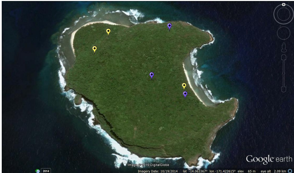
Map 7. Locations of detections of pigs. Yellow tags: direct visual detections; Purple tags: signs of pig activity and occurrence.

Pigs were visually detected on several occasions during the day and evidence of their presence recorded (Map 7). In particular, a quite large female with piglets was seen at least in one instance.