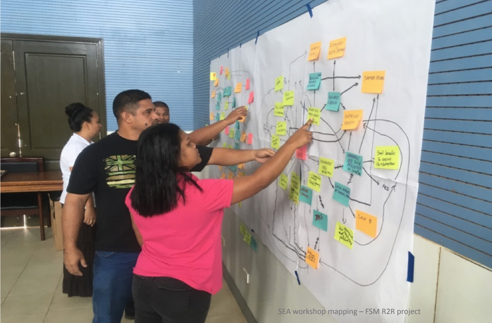
SEA workshop mapping – FSM R2R project