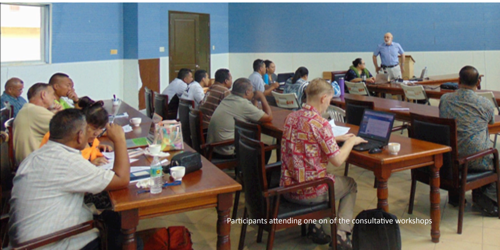
Participants attending one of the consultative workshops

The FSM States each utilise Environmental Impact Assessments (EIAs), but the SEA process is new to the FSM. Generally, the SEA is an assessment of the environmental, social and/or economic impacts of a policy, plan or programme, and it operates at higher, more thorough level, than an EIA, which only assesses the potential environmental impact of individual projects. While EIAs are relatively codified and common in the way they are executed, there is no single approach to conducting an SEA. Pacific island countries have unique circumstances to consider, with natural island ecosystems, converted land and developments concentrated in a limited land mass, and small and highly connected populations. This requires a different approach than for SEAs conducted for countries with large land masses (e.g. USA), where government jurisdiction and policies cover greater areas.