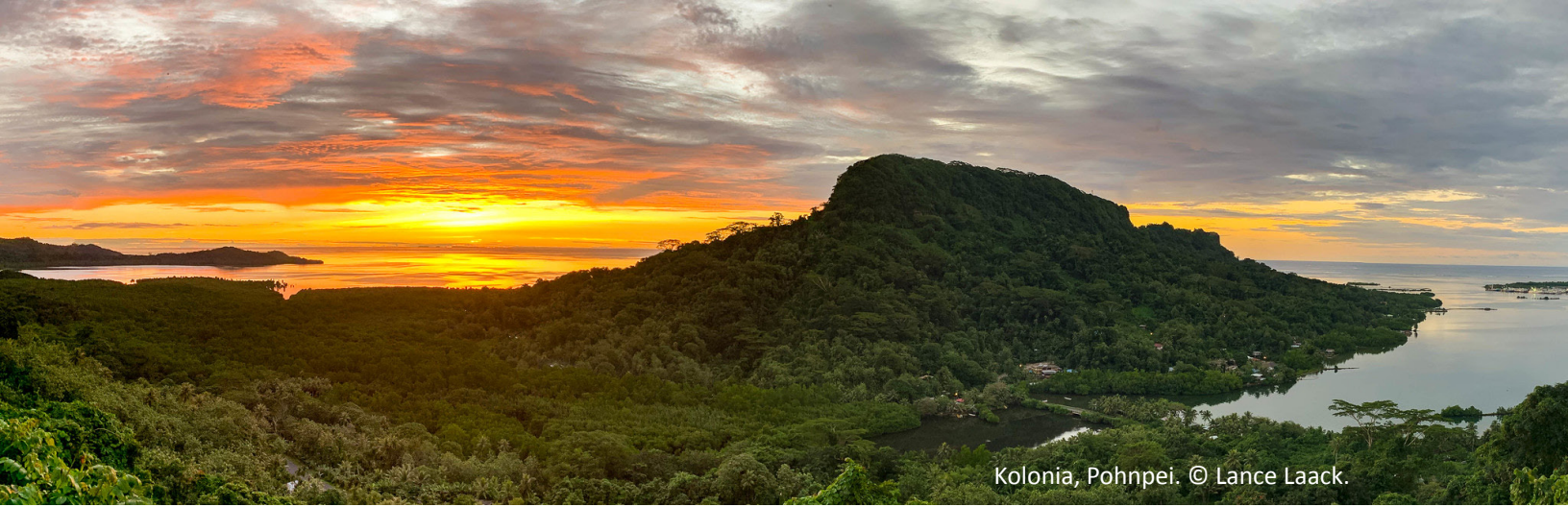
Kolonia, Pohnpei.