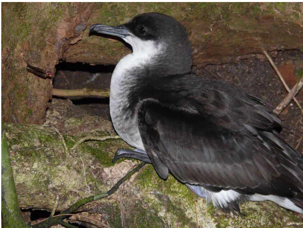
Photo: Tropical Shearwater photographed at night on Motu Molemole

nesting burrows on this island. There were many more burrows on Motu Late so it was hard to walk around part so this island without breaking into them and more than a thousand birds were likely to be nesting there. Motu Lahi was not searched sufficiently to determine if shearwaters were also using this island. No birds were located in burrows during the day so it was anticipated that the nesting season was just beginning.