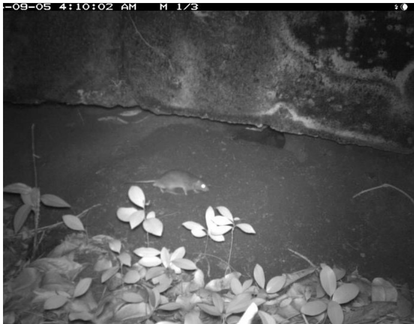
Figure 2: Rattus exulans passing malau burrow (at base of cliff) at Utupalapu at night.

The camera was set up from the morning of 4 Sept to the afternoon of 9 Sept and recorded Pacific rats ( Rattus exulans ) passing the burrow at night on three occasions (as figure 2), and again from 12 Sept to 17 Sept when it recorded nothing. No malau were detected.