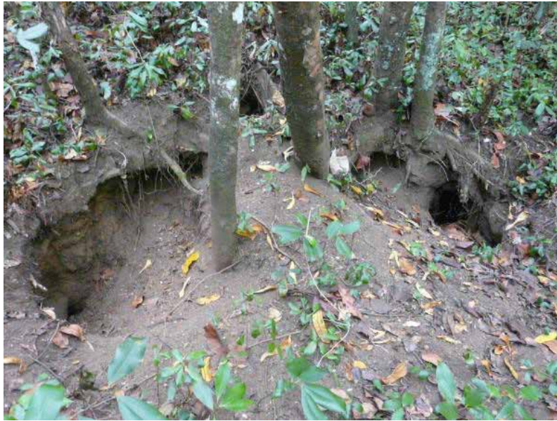
Figure 6: Burrow complex at Vai Kona

It is difficult to consistently count the numbers of burrows and different observers are likely to come up with different results. Figure 6 shows a typical situation (from Vai Kona in 2014) in which there is a relatively large hole constructed from years of digging by birds and egg collectors and several smaller holes around its edge. It requires an experienced eye, or some digging, to be sure which side-holes are in use (i.e. have had eggs laid in them). At some sites (but not in this case because plants are growing there) the main burrow is in the centre of the hole and not revealed by any depression in the ground but by loose soil and leaves.