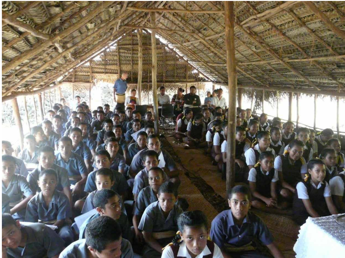
Figure 5: High school assembly.