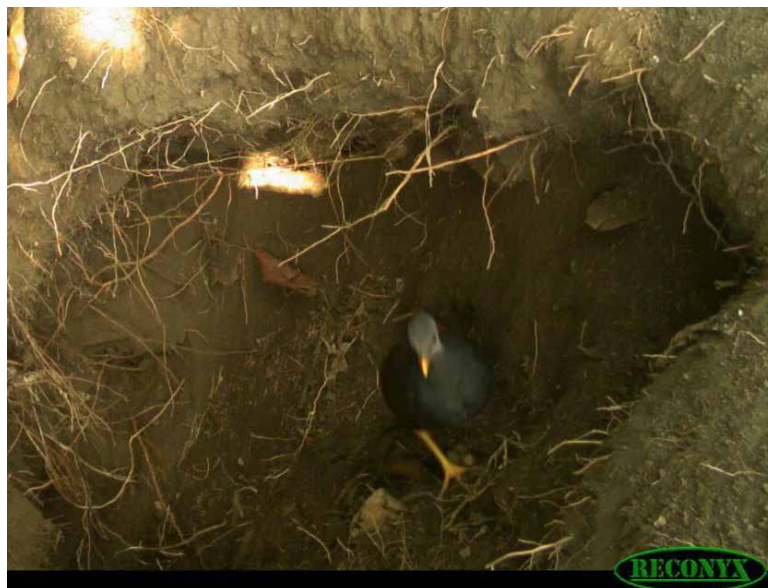
Figure 3: Malau digging in daytime at burrow on Motu Molemole

The camera was set up on the main burrow from 1.50pm on 9 Sept to 9.30am on 10 Sep. Twelve separate sequences of malau were recorded (as Figure 3), the earliest at 6.44am, including one in which a bird was chasing off another animal (rat or bird – too out of focus to identify). Considering the length of time between different sequences it is thought that these represented six different visits and up to six different birds.