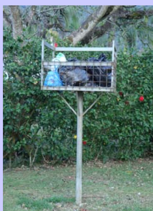
Rubbish stand in Samoa

When a waste collection service is available, public participation varies, and this can be measured by the amount of litter and illegal dumping activities taking place.