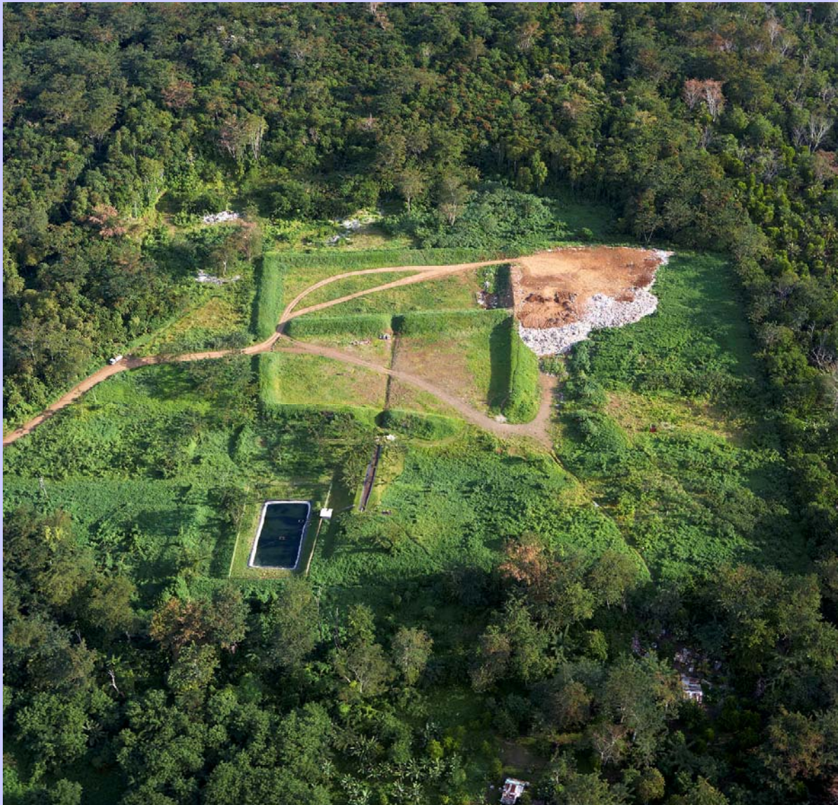
Aerial view of the Tafaigata Landfill in Samoa

It was clear that focusing on waste disposal alone by improving the landfill, only solved a part of the problem, and as a result the landfill will require expansion far sooner than was originally planned. The focus has now expanded to include measures that address waste minimization and reduction at source in order to reduce residual waste entering the Tafaigata Landfill.