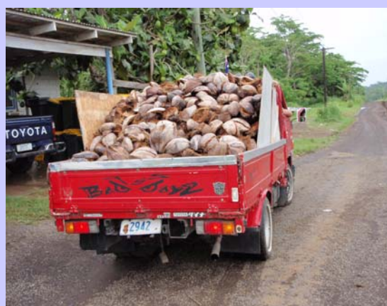
Typical collection vehicle in Samoa