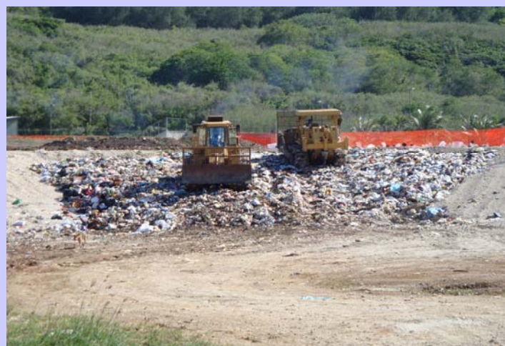
Anaerobic Landfill in Northern Mariana Islands