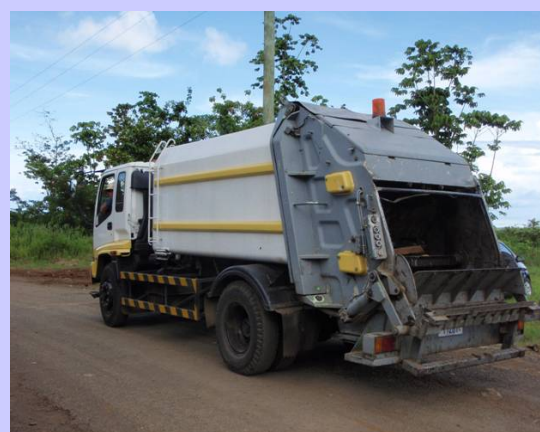
Typical collection vehicle in Samoa