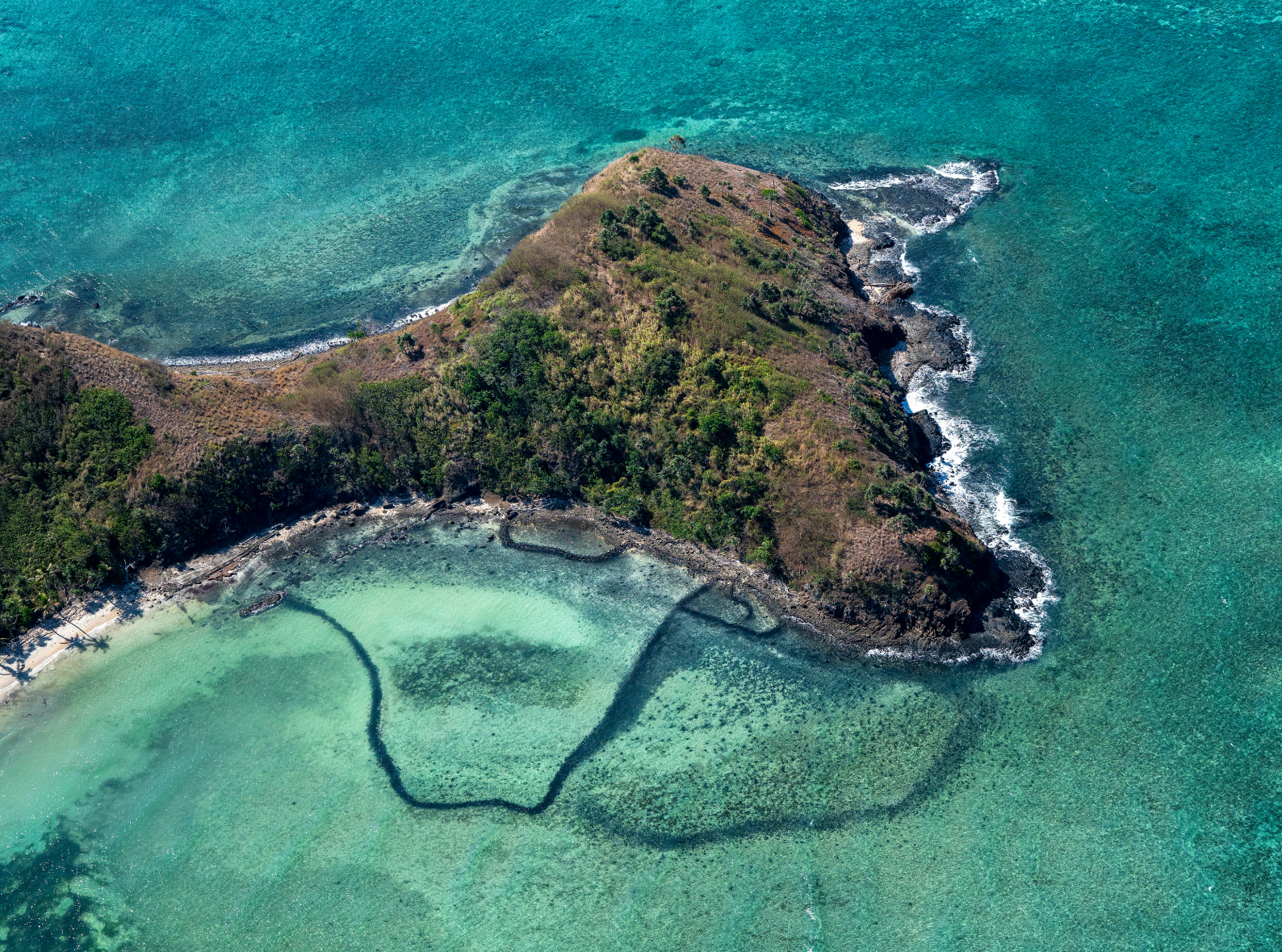
Traditional stone fish traps, Naviti Island, Fiji.