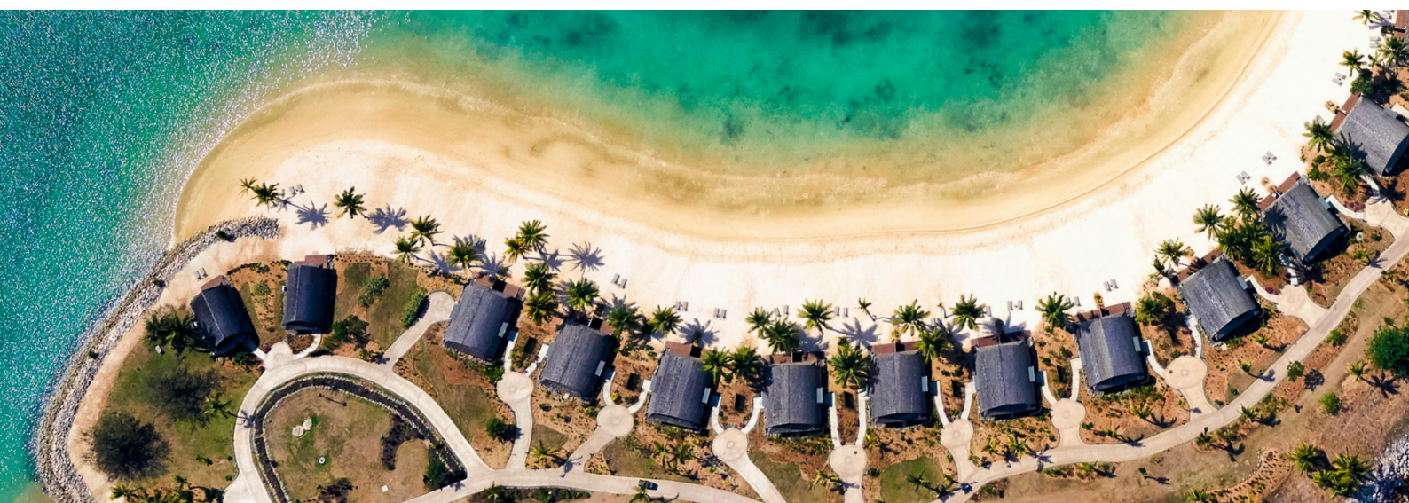
Tourist resort, Momi bay, Fiji