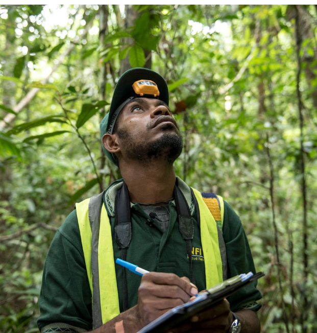
Forest research. NFI camp near Kupiano, Papua New Guinea.