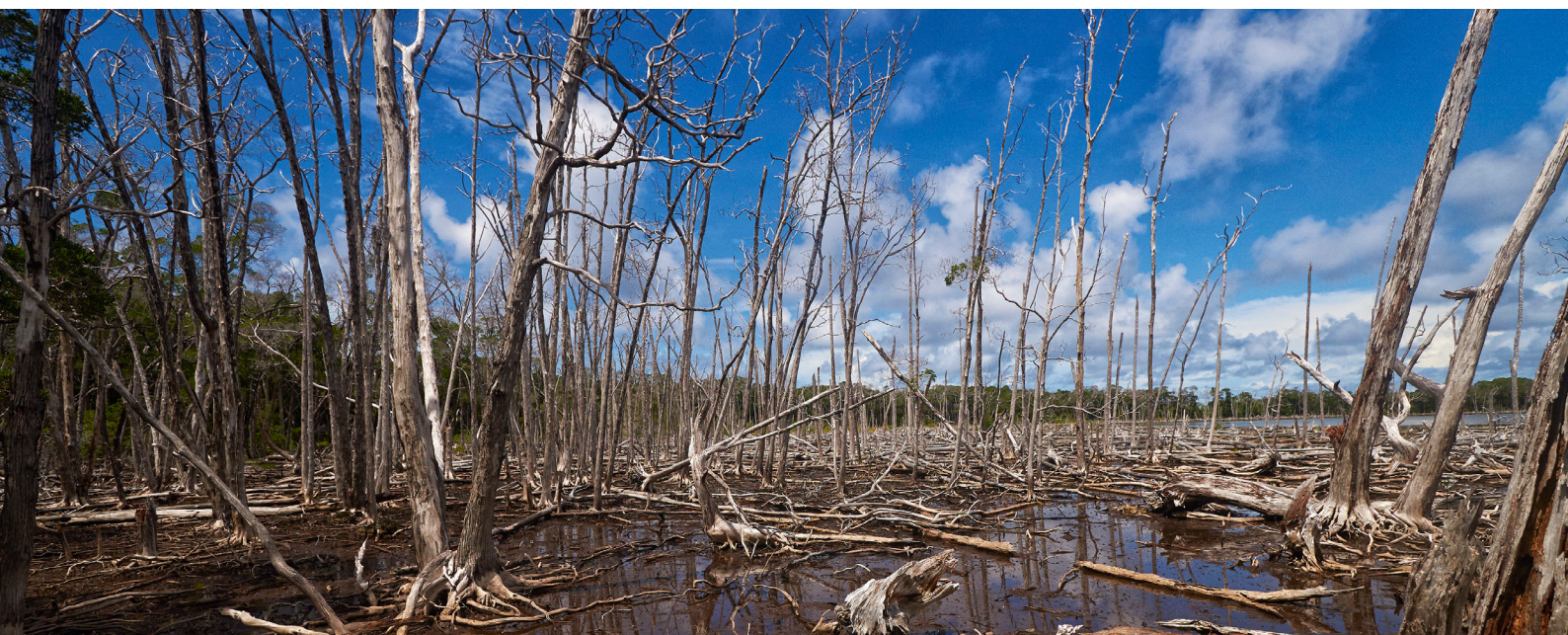
Dead forest on disappearing island, Solomon Islands