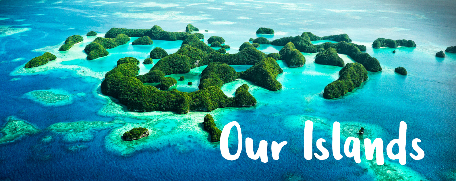
Rock Islands, Palau.