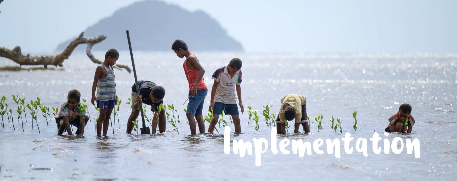
Mangrove replanting.