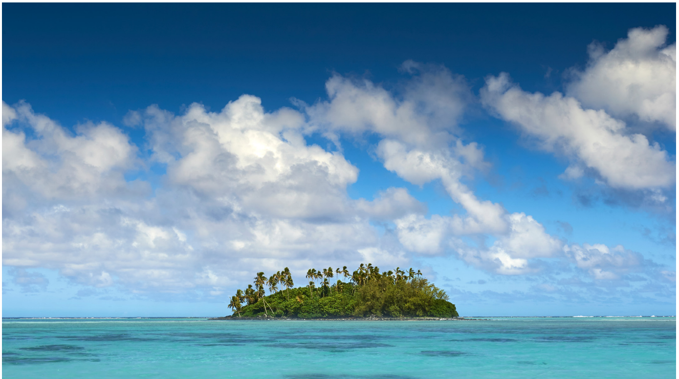
Cook Islands, Rarotonga.

A key principle of multilateral agreements is that the delivery of any one agreement or framework should be consistent with that of others. Implementation of this Framework should therefore occur in a manner that aligns with other relevant global and regional frameworks; a selection of the most directly relevant are presented in Appendix B.