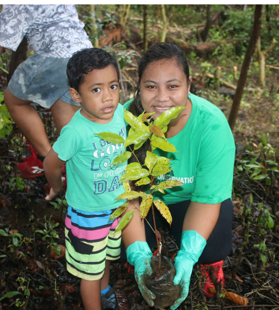
2 Million Tree Planting Campaign