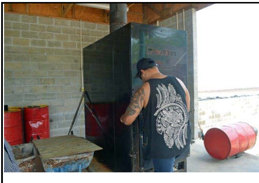
Photo 14: MediBurn used at ISI's compound (taken 15/04/2014 by Natalie Stella ref:DSC0455)