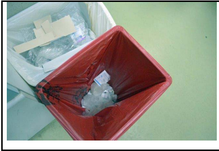
Photo 7: Example of HCW disposal at Majuro Hospital, no signage, high level of cross-contamination observed throughout the hospital (taken 15/04/2014 ref:DSC0139)