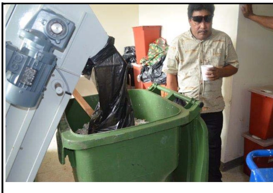
Photo 4: SteriMed used for the maceration of sharps at Ebeye Hospital (taken 14/04/2014 by Natalie Stella ref:DSC0899)