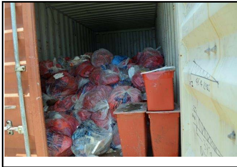
Photo 13: HCW at ISI's compound before incineration (taken 15/04/2014 by Natalie Stella ref:DSC0412)