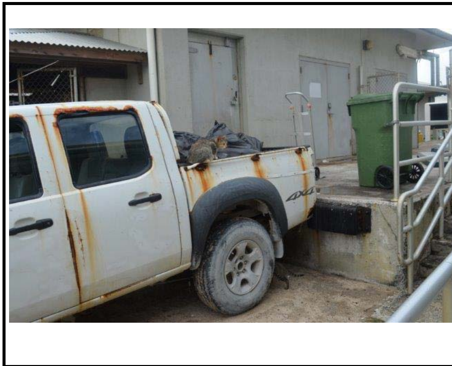
Photo 3: Vehicle used to transport general and HCW to Ebeye Landfill (taken 14/04/2014 by Natalie Stella ref:DSC0887)