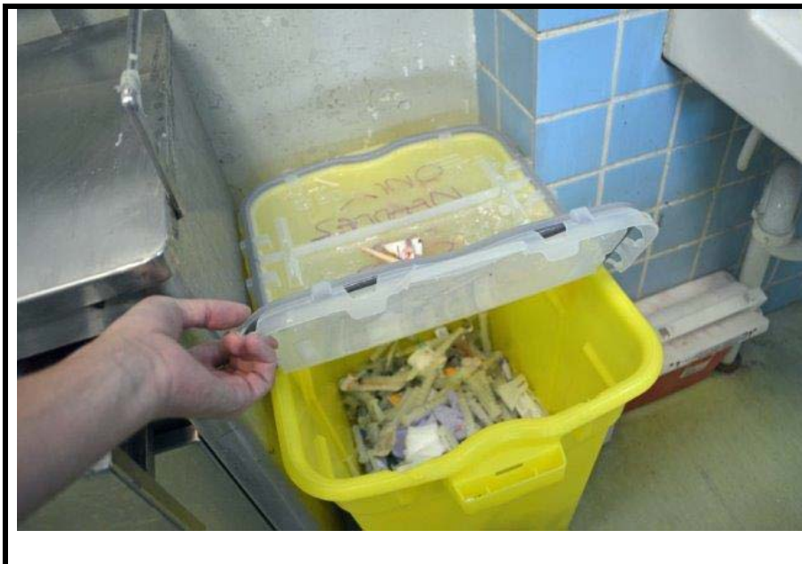
Photo 6: Example of HCW disposal at Majuro Hospital