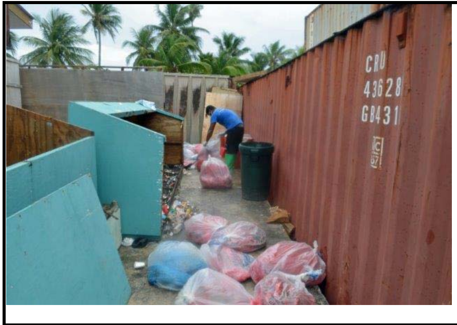
Photo 9: ISI contractors segregating general and HCW (taken 15/04/2014 by Natalie Stella ref:DSC0068)