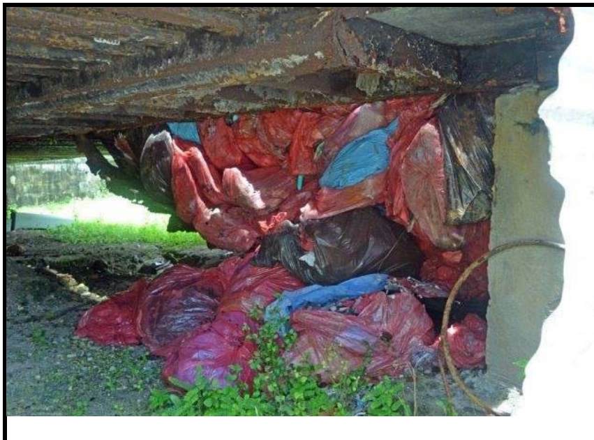
Photo 12: Former contractor's compound. HCW still stored here and seeping out of the bottom of a shipping container (taken 15/04/2014 by Natalie Stella ref:DSC0413)