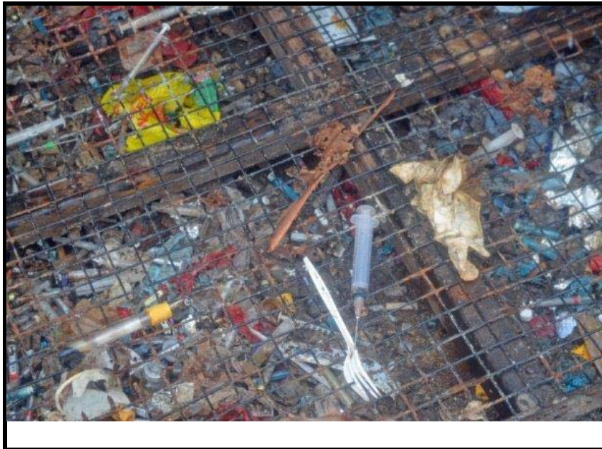
Photo 11: Sharps observed on the ground at the sorting area at the rear of the hospital (taken 15/04/2014 by Natalie Stella ref: DSC0345)