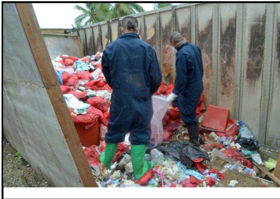
Photo 10: ISI contractors segregating general and HCW (taken 15/04/2014 ref:DSC0101)