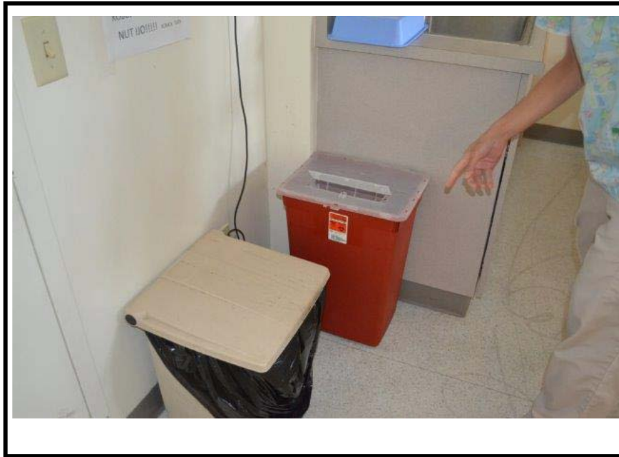
Photo 1: Example of healthcare waste disposal at Ebeye Hospital.