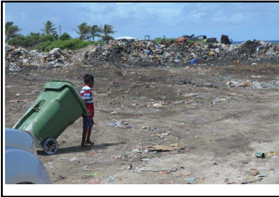
Photo 5: A child scavenging at Ebeye Landfill where healthcare waste is disposed of (taken 14/04/2014 by Natalie Stella ref:DSC0975)