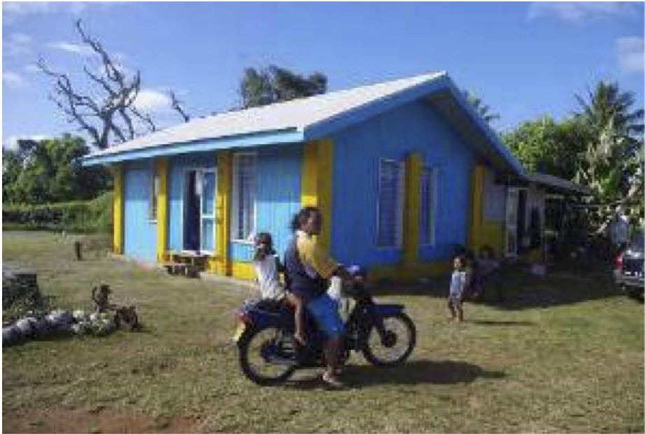
Figure 2. A two-bedroom house in the Aitutaki project

There was minimal or no consultation with beneficiaries. After the designs were done, they were shown to the affected communities, and most of them accepted the designs to be able to get free houses. During construction, some households made changes, for which they had to bear any extra costs incurred. The houses were expected to be painted and floor finishes (tiles, linoleum, etc) to be provided later by the beneficiaries, which some of them had done or were in the process of doing with their own funds.