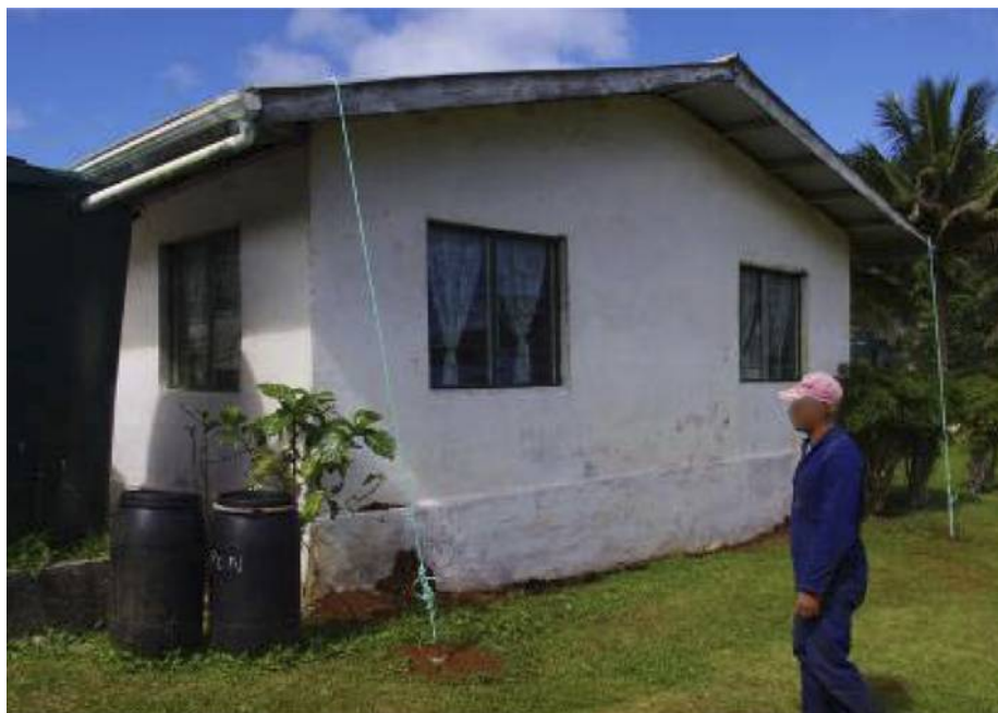
Figure 3. A house with the roof anchoring system

somewhat isolated from the main part of the island. Therefore, it was chosen to begin the DRR roof anchoring project here.