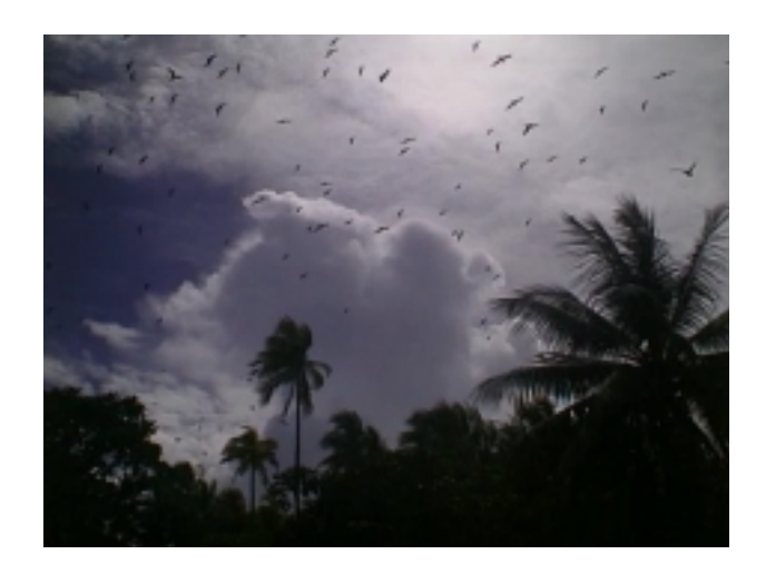
Figure 3. Seabirds flying over Euarpik atoll.

the most diverse mangroves and agroforests in the FSM. Atolls also have special features such as uninhabited islets with "inland mangroves" (such as Bruguiera gymnorrhiza ) that apparently make use of the fresh or brackish water lens toward the interior of the islet. Uninhabited islets of atolls are also very important as sites of seabird and sea turtle rookeries and also provide sites for coconut crab larvae to come ashore and develop.