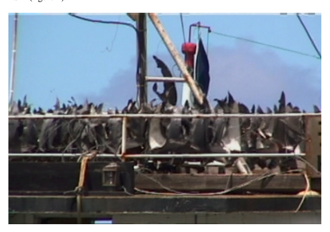
Figure 4. Shark fins drying aboard Taiwanese fishing boats anchored at Yap State Fisheries dock .

Commercial exploitation of sharks thus poses a great threat to subsistence fisheries. It also poses a threat to the FSM's developing dive industry. Visiting divers, cherish encounters with sharks and sharks are quite valuable to the dive industry. The shark fin trade affects our visitor industry in other ways as well. The practice of shark finning involves cutting the fins off of live sharks and throwing them back in the water. This is seen as a barbaric practice and shark finning has been banned in a number of countries including Canada, Brazil, the United States, much of Australia, and most recently, Palau. Visitors to Yap have expressed disgust that shark finning appears to be tolerated in the FSM (figure 4).