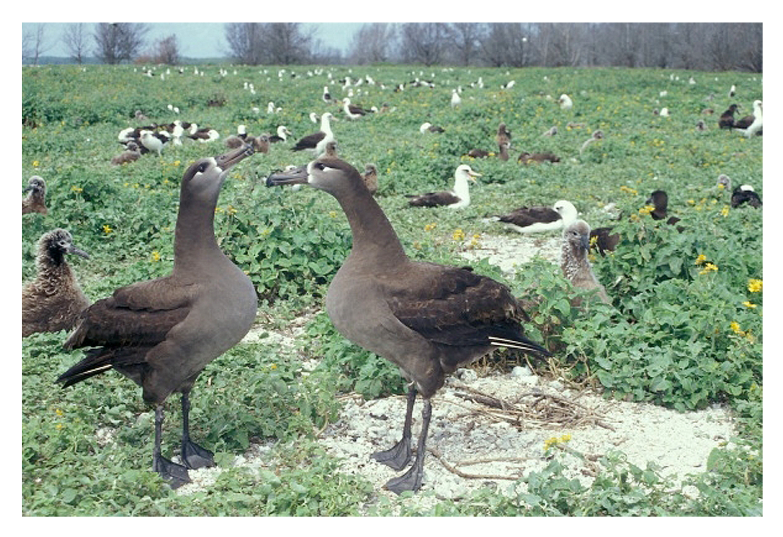
FIGURE 3. A field of Verbesina encelioides (golden crownbeard) on Eastern Island (Midway Atoll, Hawai'i) with a pair of black-footed albatross dancing in front of some Laysan albatross.

similar results comprised were found. In 1991, V. encelioides stands composed 18.2 ha, and in 2004 they comprised 60.0 ha—an increase of 230% (Laniawe 2004a). Very few areas were found where native species codominated the habitat with V. encelioides (Laniawe 2004a).