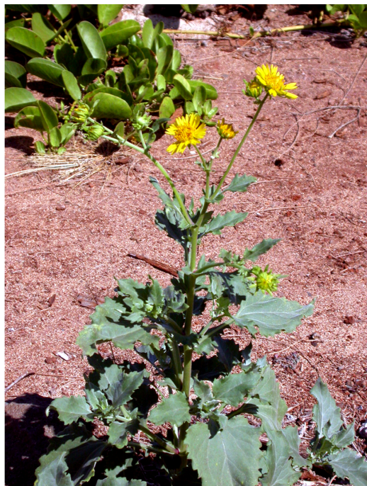
FIGURE 1. Verbesina encelioides (golden crownbeard) growing at Kanahā Beach Park near Kahului, Maui, Hawai'i.

Common names: golden crownbeard, crownbeard, golden crown daisy, wild sunflower, cowpen daisy, girasolcito, anil del muerto, yellowtop, American dogweed, butter daisy, South African daisy.