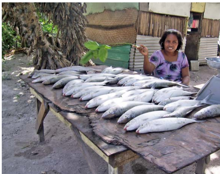
Figure 2. Bonefish ( Albula glossodonta ) being sold along the roadside.

The term “destructive fishing” has often been used for a wide range of activities, from classical overfishing (non-sustainable use) to outright destruction of the resource and the environment (e.g. use of explosives or other methods) with significant and definitive impacts. Destructive fishing practices or the destructive use of gear in the wrong habitat should be prohibited or strictly regulated so that it affects only a relatively small part of the given habitat. On the other hand, the impact of destructive methods can be so indiscriminate and/or irreversible that they are universally considered “destructive” no matter what circumstance they are used in. Non-selective or destructive methods tend to catch many different species at all life stages, or they can be potentially dangerous to people who use them (e.g. dynamite, cyanide, traditional and modern poisons). Veitayaki et al. (1995) provide an overview of destructive fishing practices in the Pacific Islands. There has been little research done on the above practices, mainly because the people who use these methods are generally not willing to talk about these practices as they know they are either illegal or harmful.