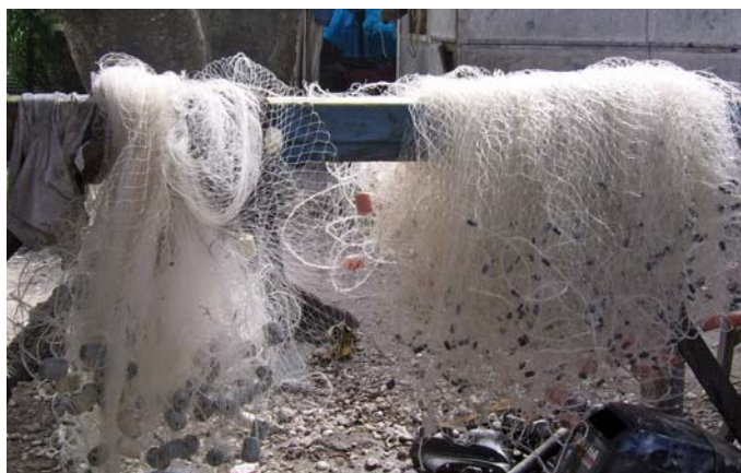
Figure 1. A typical gill net commonly used by fishers in Tarawa.

The main fish species targeted by gill netting and hand-lining include bonefish ( Albula glossodonta ), paddletail snapper ( Lutjanus gibbus ), goatfish ( Upeneus taenoguttatus ), spangled emperor ( Lethrinus nebulosus ), mullet (various species), silver biddy ( Gerres sp.), flametail snapper