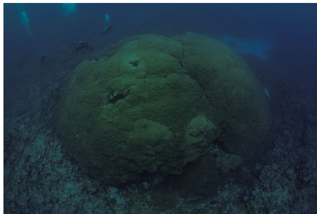
Figure 3. The newly identified and measured Porites sp. colony located in Ta'u, American Samoa.

between estimates of over 200 years for both corals is noteworthy and illustrates the variability associated with determining ages for long-lived species.