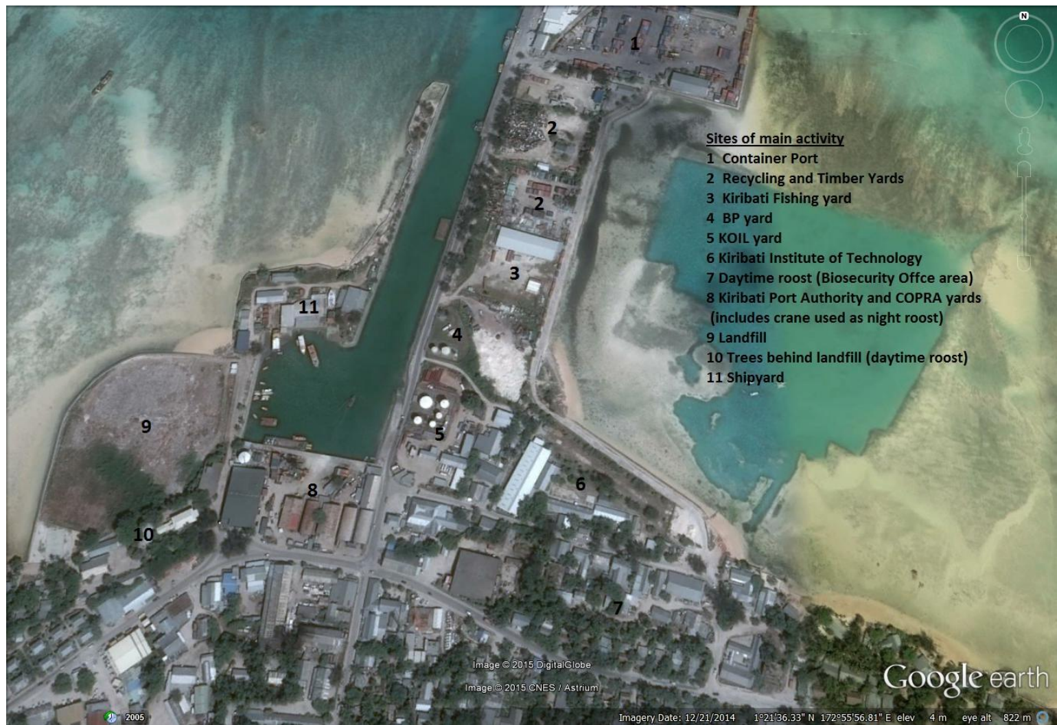
Figure 3: Key sites used by myna at Betio.