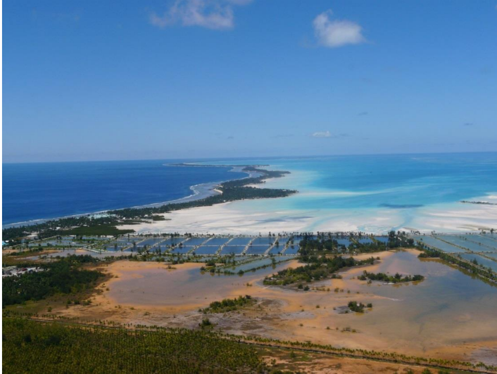
Photo 1: Tarawa – aerial view from near airport with Betio village in far distance.