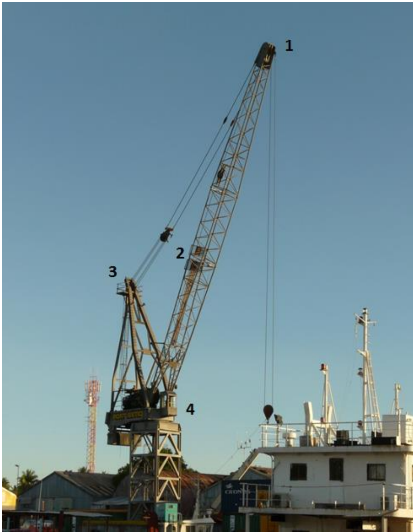
Photo 8: Night roosts of different birds on disused port crane, Betio.