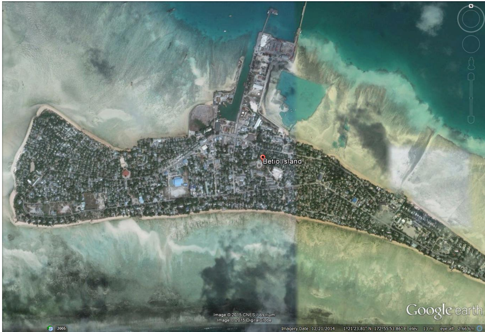
Figure 2: Betio Island – Dec 2013 satellite imagery