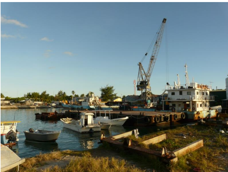
Photo 15: from near entrance to shipyard (11) looking back towards 8.