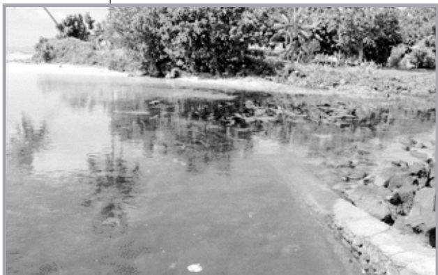
Evidence of eutropication in Puka Stream

There is always an outbreak of diseases after floods with people suffering from skin diseases, stomachaches, and flu. This may have been due to the fact that floods last for days or even a week or two. The ford built after cyclone Ofa blocks the flow of river and poor drainage have