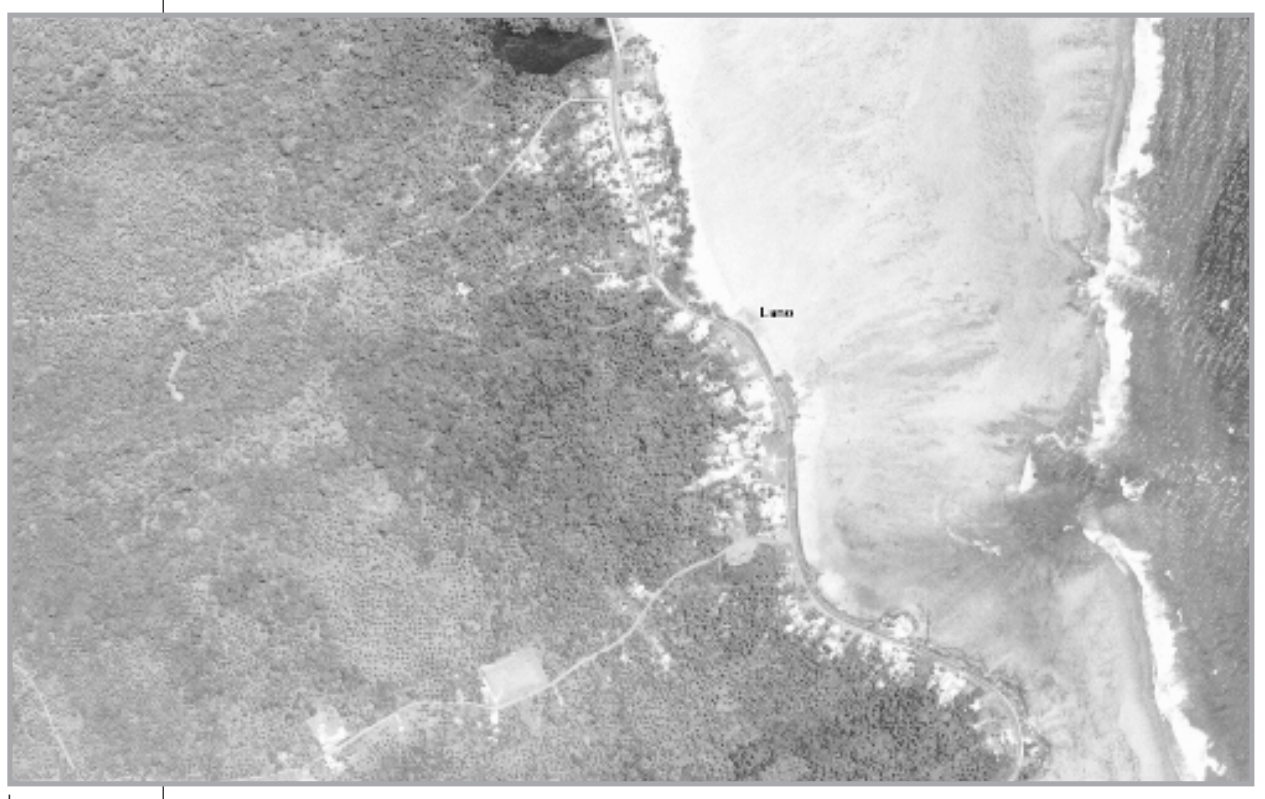
Lano map

Lano village is found in the district of Faasaleleaga IV on the island of Savaii. The coastal plain is very narrow and the slopes behind are partially cleared for copra and taro cultivation. The beach is composed of moderately exposed coral sand with occasional beach rock formations. The coral reef is relatively narrow (200-800m) and the lagoon is shallow (max 1m at low tide) and sandy with patches of seagrass. Main Coast Road transects the village parallel