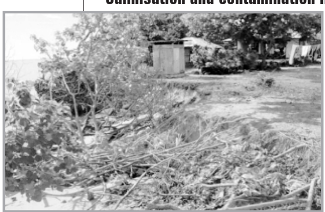
Evidence of coastal erosion