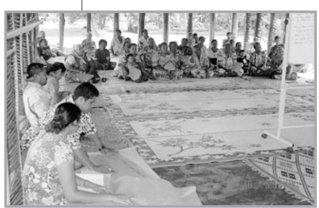
Women's Committee focus group session - Lano

nerability issues. Children of all age group attended the night session and their understanding was also tested and observed by the team.