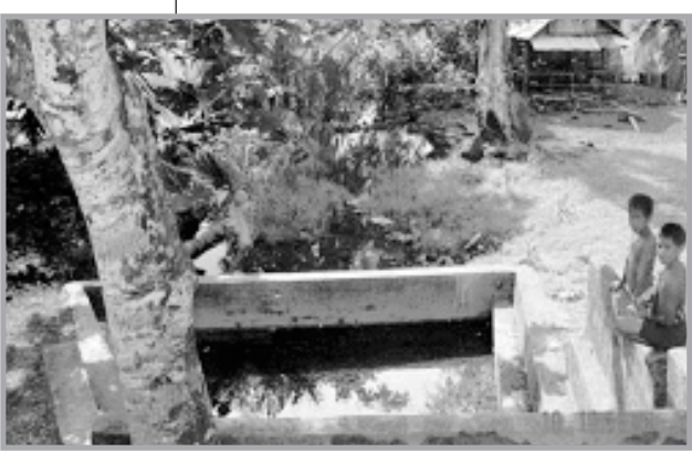
Coastal spring protected by the village but still facing salinisation

Increase temperature and warming of the sea also poses threats not only to their supply of