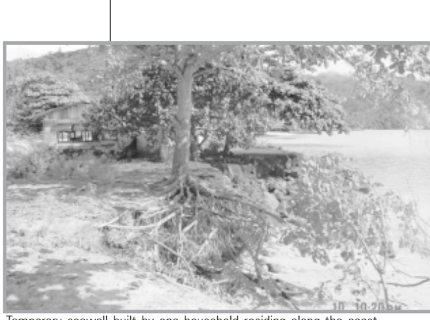
Temporary seawall built by one household residing along the coast