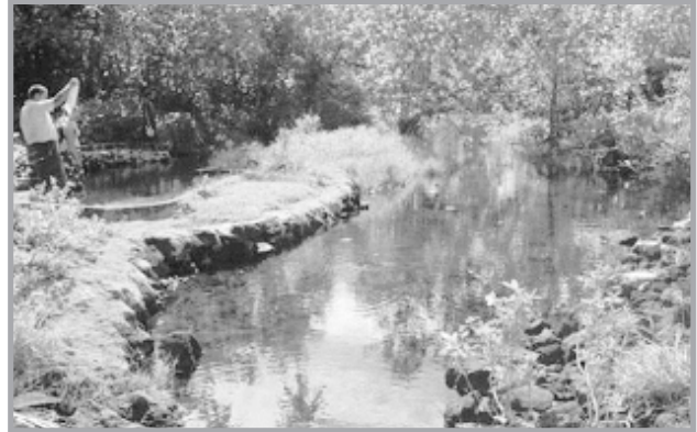
Puka stream - Freshwater pool now contaminated by saltwater intrusion

Lano village is suffering today from flooding events and droughts. These two extremes have crippled the village in terms of drinking water supply especially from coastal springs, which play a major role not only in supplying water for consumption but more significantly a symbol of their cultural identity and heritage. The name of each spring is a result of an event from a tale, myth or legend that have cultural significance to the village. For example the origins of "faalupega" ( honorific titles) of Lano have evolved from such events. The entire village was flooded as a result of intense rainfalls and consequently piped water supply was