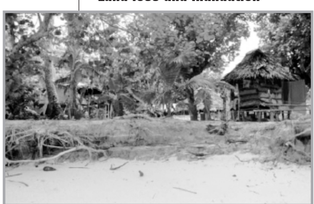
Land loss and inundation