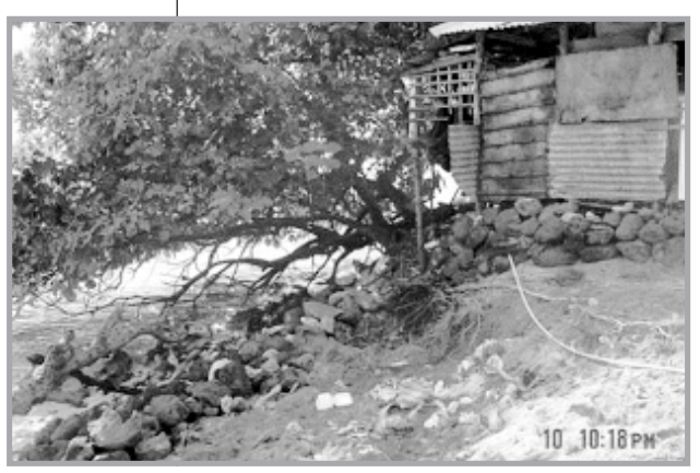
A coastal settlement at risk to erosion

The marine environment in Saoluafata village is being stressed considerably by the warming of the ocean around the village, a result of the current climate variability affecting Samoa and the Pacific as a whole. Fishermen have reported coral bleaching or the visible whitening of coral in the village marine reserve. These village fishermen have also stated that due to bleaching some corals do not recover thus affecting the total fish catch that they usually get in the area. The corals are impacted adversely not only from warming waters but also from sedimentation during flood events.