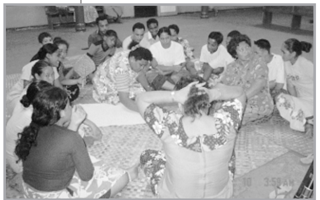
School children focus group session in Saoluafata

After the consultation process a full-scale awareness program was carried out by the team to raise the level of awareness of communities on the science of climate change and also on how human activities enhance vulnerabilities. This provided the opportunity to clarify many