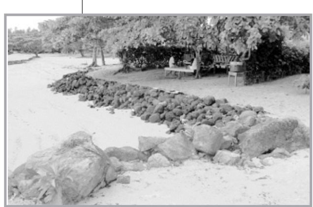
Temporary seawall built by one household residing along the coast

Frequent and intense cyclones and more drought periods will surely again hit crops thereby wiping out their source of income. Sea level rise and more storm surges will accelerate land loss causing social problems among the villagers, leaving unfortunate families landless, as they do not possess what it takes to protect them from coastal erosion. Importantly the village malae is threatened and the village heritage is at stake. This is ranked as high priority to the community. With projected sea level rise and frequent cyclones for Samoa, this village will lose their identity and co-existence. Salt water intrusion, is already threatening the community freshwater supply and increase sea level will destroyed their fresh water springs.