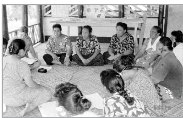
Faletua and Tausi focus group session in Saoluafata

The purpose of the community vulnerability and adaptation assessment in Saoluafata and Lano Village was to characterize the nature and extent of the community's vulnerability to climate change, current coping capacity, and identification of appropriate options that can be undertaken to enhance adaptive capacity to climate related risks. The methodology entailed a participatory research approach geared towards empowering communities to assess their own vulnerabilities and find ways and means of addressing them.