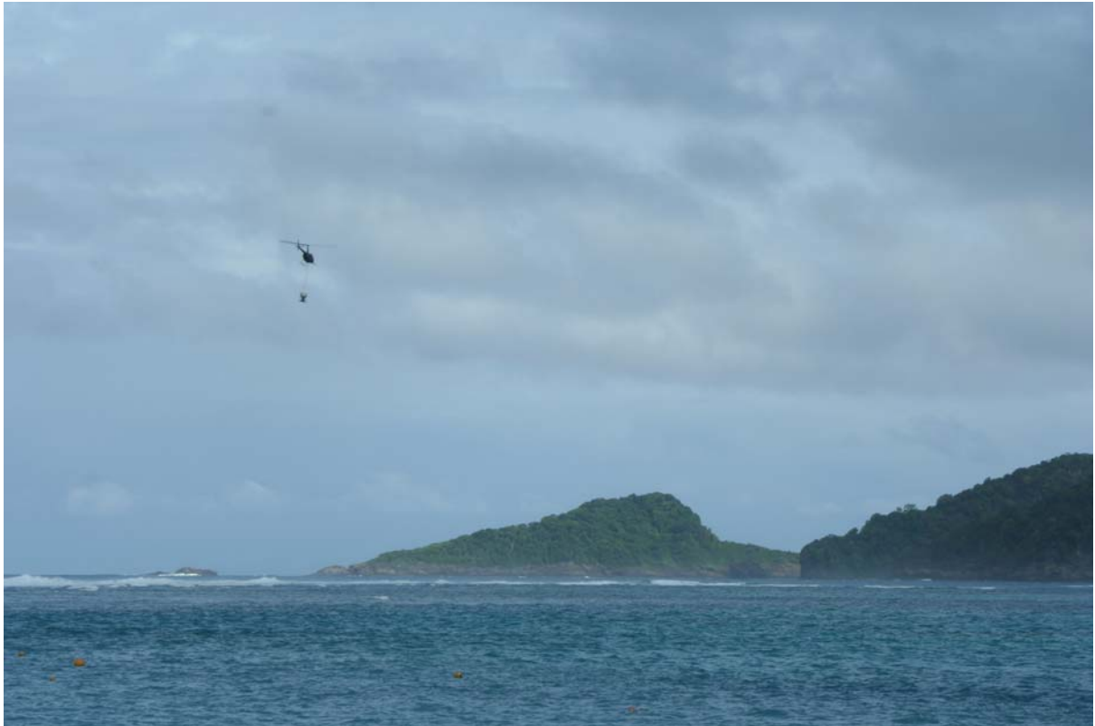
Figure 6. Helicopter heading from the operation site on Upolu to the islands, with loaded bait spreader. Nu'ulua is the further island in the centre of the photo, with Nu'utele to the right.