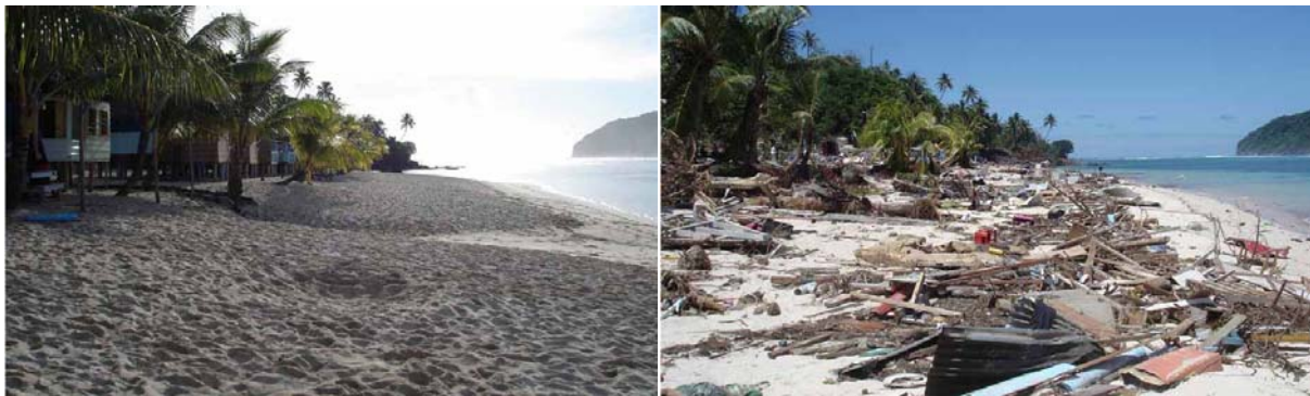
Figure 13. Lalomanu looking east, 10 December 2005 and 2 October 2009. Nu'utele Island is visible on the right.