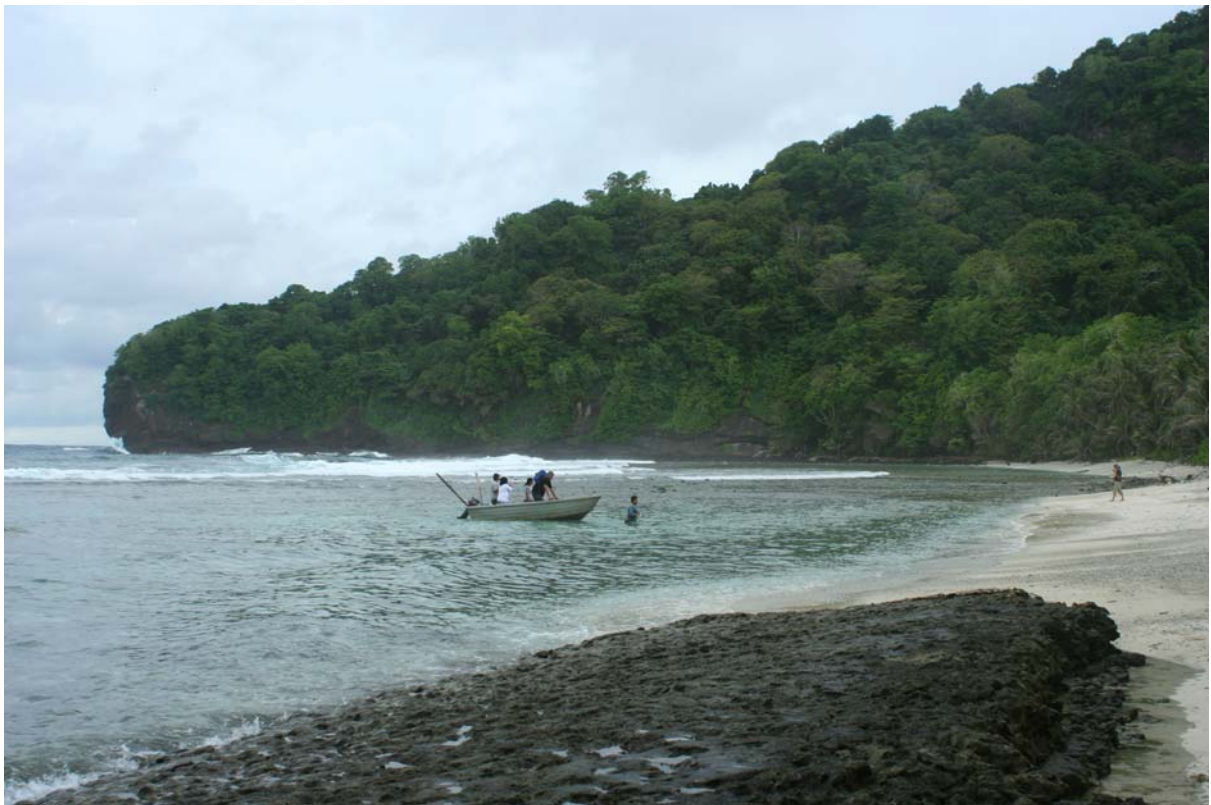
Figure 11. Landing for a monitoring visit, on Nu'utele Beach, east side of Nu'utele Island.