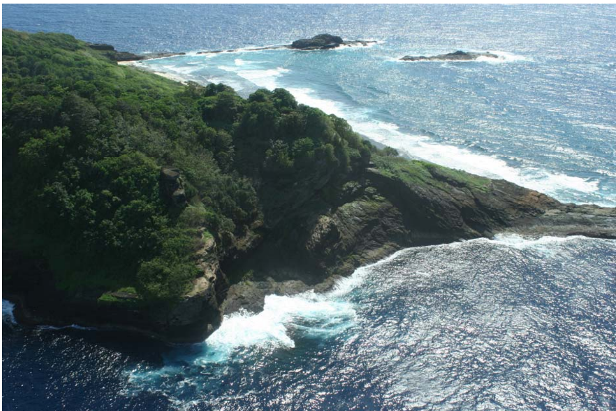
Figure 9. Landing on Nu'ulua by boat is difficult. Boats must approach between the offshore rock and the far peninsula, then land where the peninsula meets the beach. The prevalent swells from the east render this impossible most of the time.