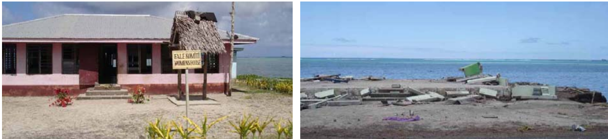
Figure 12. Ulutogia Women's Committee Centre, 22 November 2005 and 2 October 2009. Nu'utele and Nu'ulua are off the frame to the right.

major concern for any future eradication plans, whether of rats or any other pest on the islands.