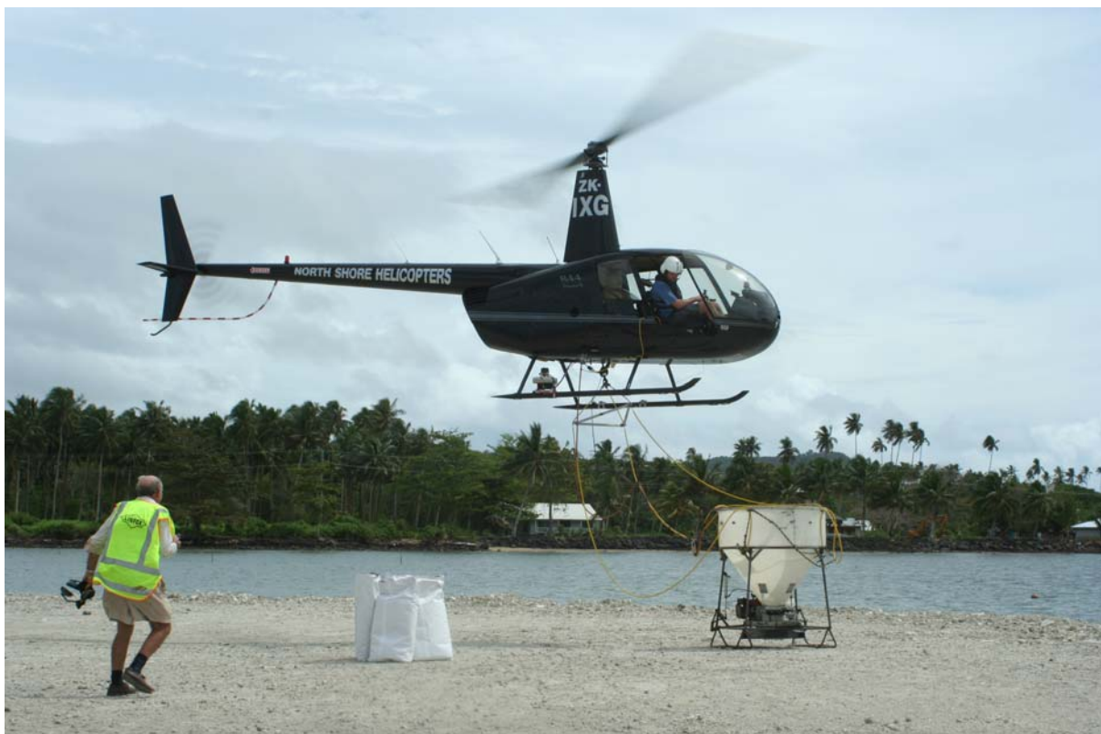
Figure 4. Robinson 44 helicopter, pilot Paul Trapski, with bait spreader bucket ready for loading, all supplied by Northshore Helicopters, New Zealand.

Once funding was approved and the two companies were asked for a quote, the Fiji one was ruled out as it could no longer supply a suitable helicopter until October. By the time another quote was obtained to satisfy CEPF requirements, there was a very tight time-frame to finalise contracts with Northshore and arrange shipping of a helicopter and spreader bucket from New Zealand (Fig. 4). This time-frame was one factor behind subsequent difficulties with the aerial drops.