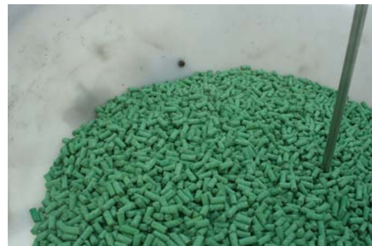
Figure 5. Brodifacoum bait awaiting loading, and in the spreader bucket.

Shipment and storage of baits went smoothly under ACP's guidance. Six pallets of 20-kg bags of bait (Fig. 5) were shipped in a container with a black condensation sheet hanging on the inside. The door of the container was opened during the day and closed at night every few days while it was in storage in Samoa, to optimize storage conditions. Shrink wrap was left on the pallets until the operation, as there was no sign of condensation.