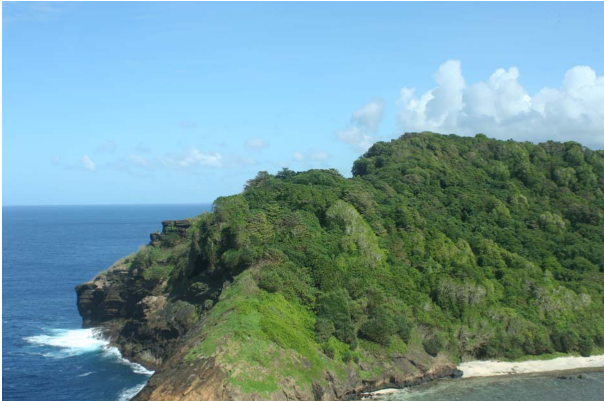
Figure 2. The southern half of Nu'ulua, from the southeast, with intact lowland forest on the interior crater slope.