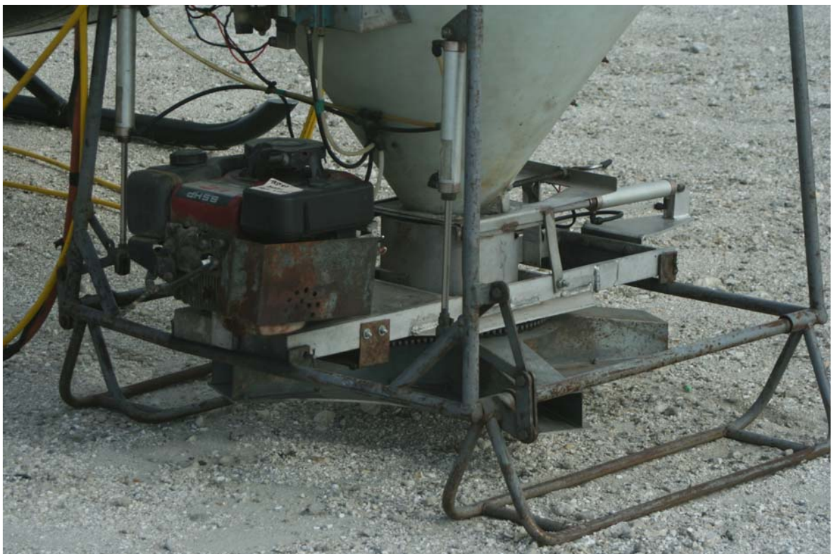
Figure 7. The bait spreader mechanism, with drive motor on the left.