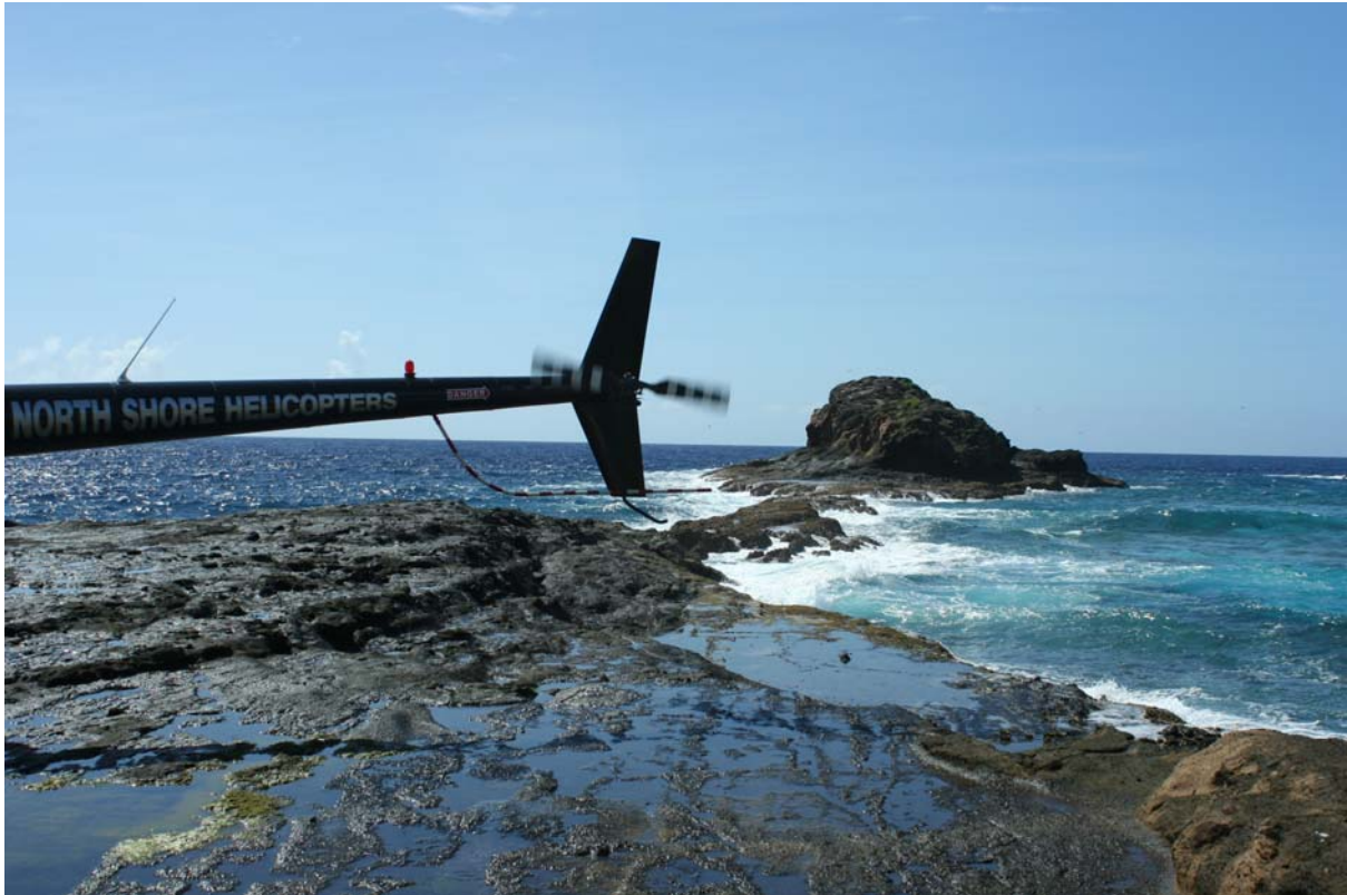
Figure 8. The helicopter landing spot on Nu'ulua Island, used for dropping the monitoring team and equipment.