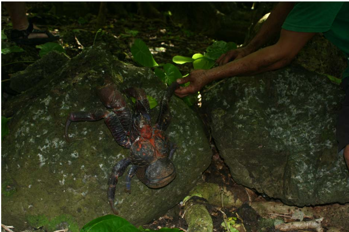
Figure 1. Coconut Crab on Nu'ulua Island.

This project was a key step towards a long-term goal of the restoration of Nu'utele (108 ha) and Nu'ulua (25 ha) islands, two of the four islands of the Aleipata group, off the eastern end of Upolu Island, Samoa. Nu'utele and Nu'ulua are major sites for the conservation of Samoa's indigenous biodiversity. They hold what are probably the largest remaining populations of the threatened (IUCN Vulnerable) Friendly Ground Dove Gallicolumba stairi in the Samoan archipelago, large populations of the Coconut Crab Birgus latro (Fig. 1), nesting Hawksbill Turtles Eretmochelys unbricata , and several species of breeding seabird. Nu'ulua also contains the most intact lowland coastal forest assemblage in Samoa (Fig. 2).