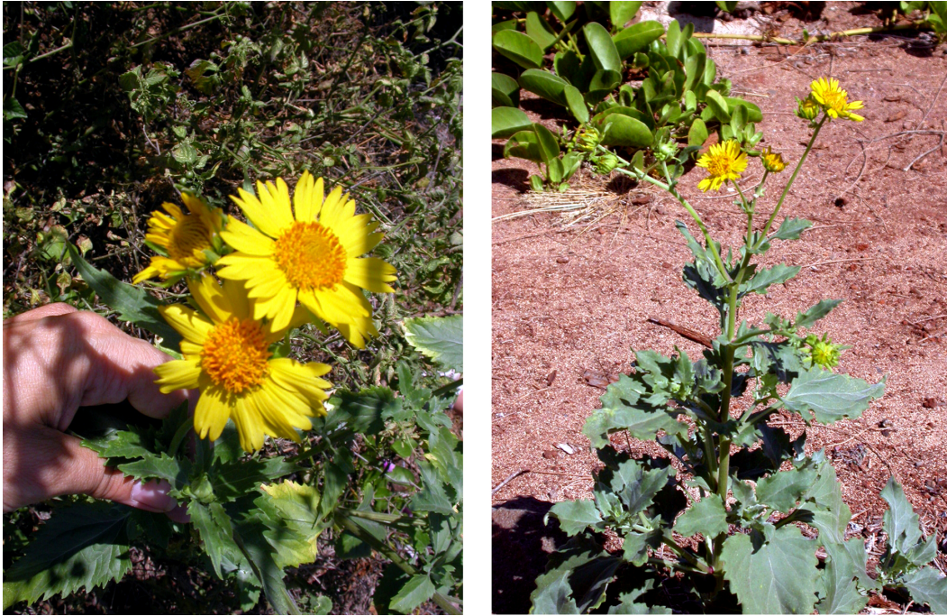
FIGURE 1. Verbesina encelioides (golden crownbeard) growing at Kanahā Beach Park near Kahului, Maui, Hawai'i.

Common names: golden crownbeard, crownbeard, golden crown daisy, wild sunflower, cowpen daisy, girasolcito, anil del muerto, yellowtop, American dogweed, butter daisy, South African daisy.