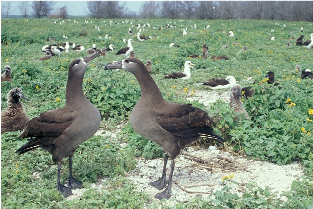
FIGURE 3. A field of Verbesina encelioides (golden crownbeard) on Eastern Island (Midway Atoll, Hawai'i) with a pair of black-footed albatross dancing in front of some Laysan albatross.

similar results comprised were found. In 1991, V. encelioides stands composed 18.2 ha, and in 2004 they comprised 60.0 ha—an increase of 230% (Laniawe 2004a). Very few areas were found where native species co-dominated the habitat with V. encelioides (Laniawe 2004a).