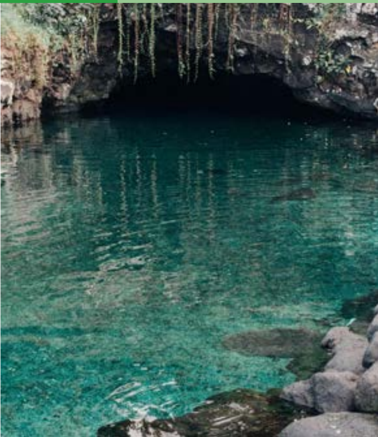
Piula freshwater pool, Samoa.