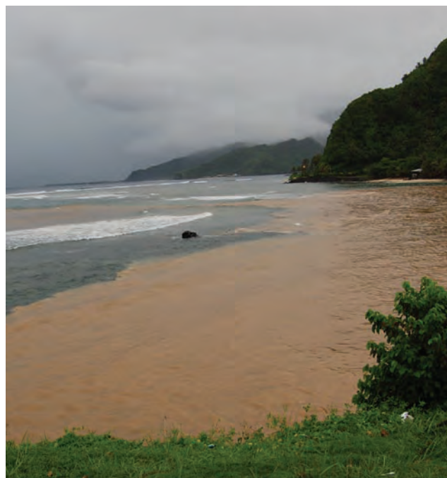
Left Image: Effective regulation of marine resources is one method to increase fish stocks in the territory. Here, DMWR enforcement officers check for undersized invertebrate species in cargo arriving in American Samoa. Right Image: Sedimentation from streams after heavy rainfall on Tutuila Island.