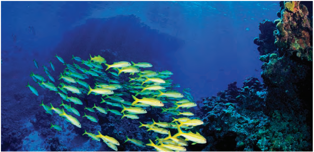
Goatfish school in Rose Atoll lagoon.

visitors from around the world.” The National Park is really “three parks” on four separate islands. Ofu and Olosega have the most accessible coral reefs and miles of beaches. Tutuila has road-accessible forests, native wildlife and scenic coastline.