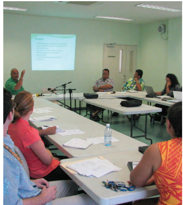
Left Image: Reef to ridge connections are an important part of the Two Samoas Initiative. Right Image: Natural resource managers from Samoa and American Samoa develop collaborative regional efforts under the Two Samoas Initiative.