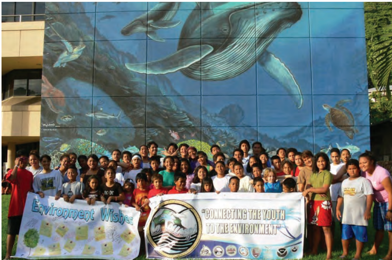
Students from the 2010 Enviro-Discovery Summer Camp show off their environmental wishes; the camp is run by Le Tausagi and CRAG every summer.

improving services and educational programs.