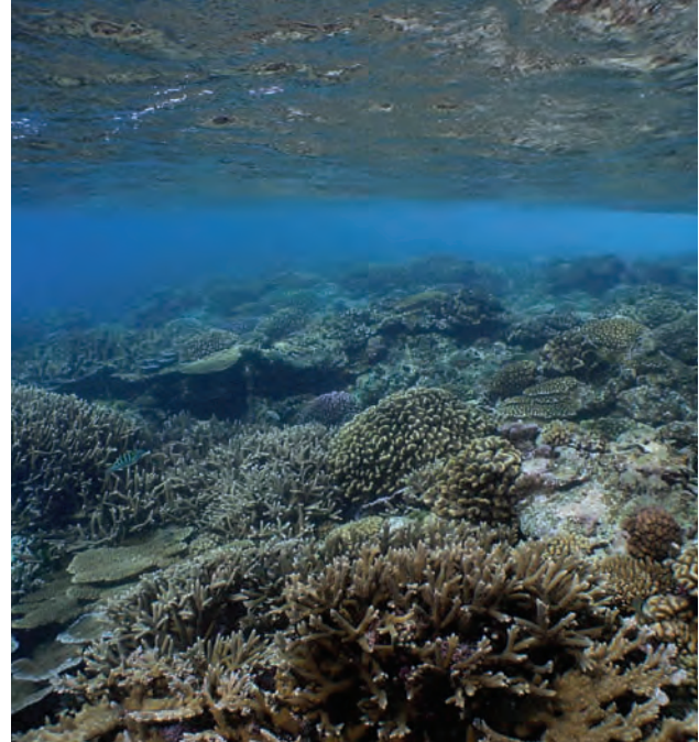
Left Image: Participants in the priority-setting workshop review a vote on the priority sites for American Samoa. Right Image: An example of some of the corals that can be found on American Samoa's reefs.

it will need to be fully explained why the requested funding is most appropriate for the off-priority work versus efforts to address the priority Goals and Objectives identified through this process.