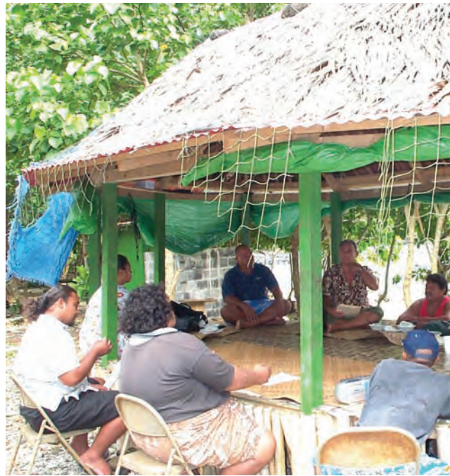
Left Image: Research, monitoring, and adaptive management are a selection of tools American Samoa has identified to combat the effects, like the coral bleaching pictured, of climate change on its reefs. Right Image: Encouraging a communal 'sense of guardianship' of the environment is one goal to improve the health of American Samoa's reef resources.

significant habitats and species, such as sea grass, wetlands, turtles, reefs, mangroves, fish and sharks. [3]