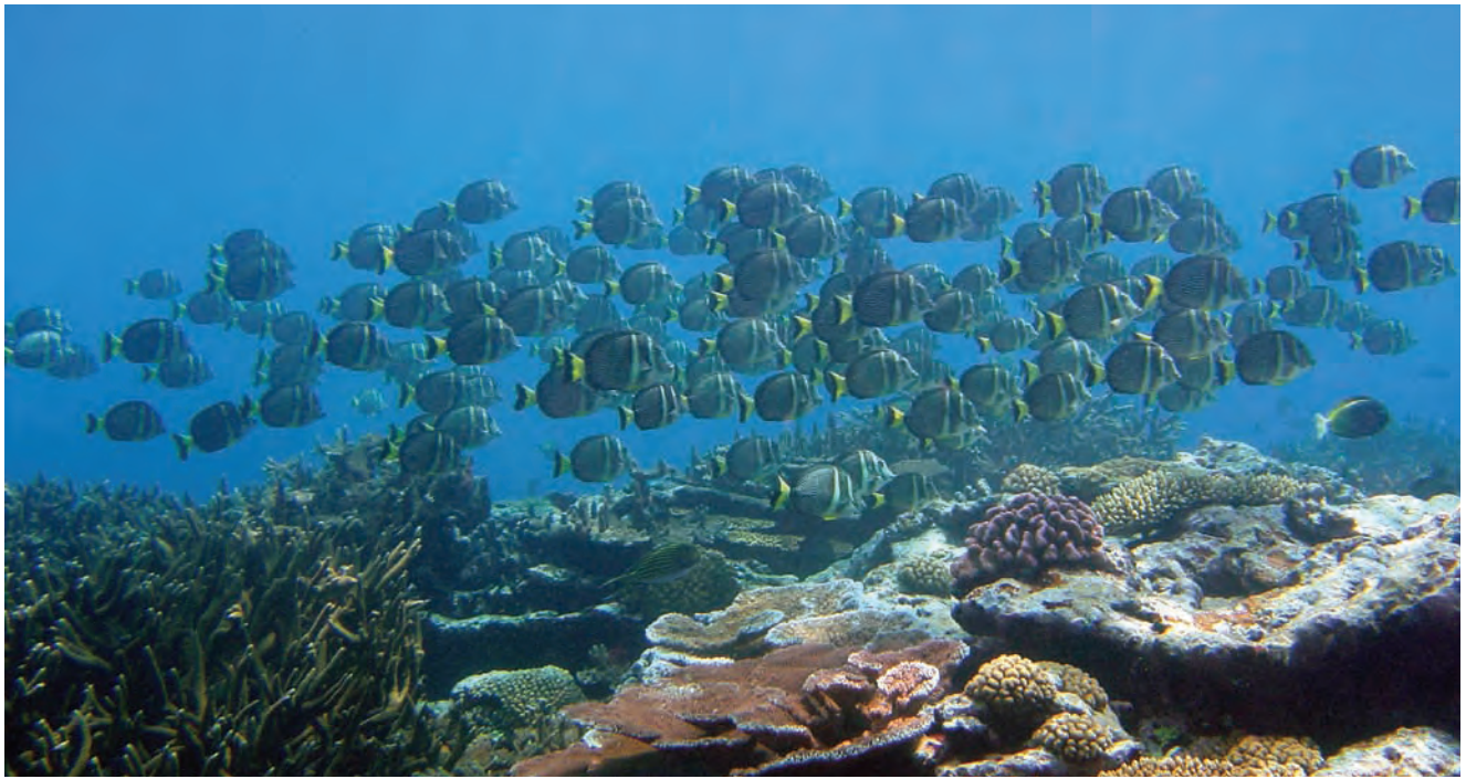
White-spotted surgeonfish schooling over a reef.

Workshop participants worked from the Situation Analysis, current Local Action Strategy (LAS) goals and interview results to develop specific and time-bound goals and objectives to address each of these need areas. Participants were asked to develop goals and objectives for the coral reefs for all of American Samoa, rather than for the mandated area of each workshop participant.