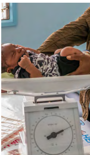
Access to quality health care is a major challenge in Papua New Guinea. The government is working with its development partners, like ADB, to change that.