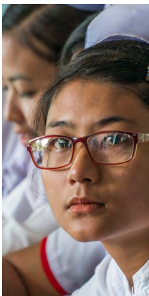
ADB will support health systems development, health security and communicable disease management, and health governance.

To tackle these ongoing regional health challenges, the Asian Development Bank (ADB) has strengthened its health sector portfolio and is continuing to engage Governments to advise, support, and implement innovative health programs.