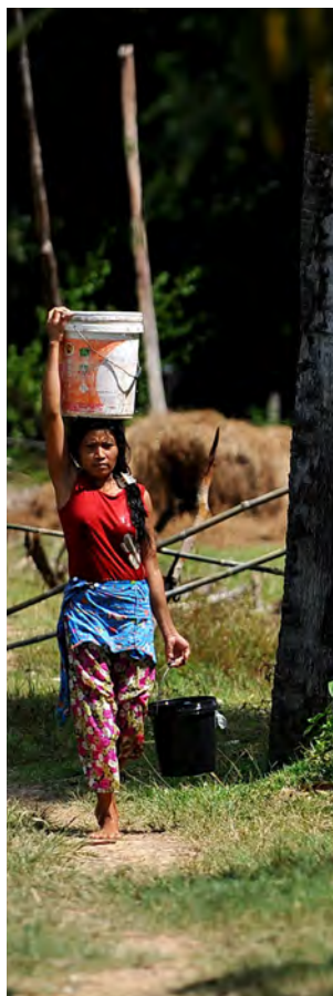
Financing health care is a major and growing policy challenge for many countries in Asia.

IN THIS BRIEF: CHALLENGES • THE SOLUTION • PROJECTS IN MONGOLIA AND PAPUA NEW GUINEA