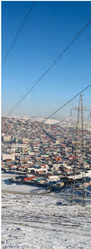
The picturesque setting of Mongolia's capital city cannot mask air pollution levels that are among the highest in the world.